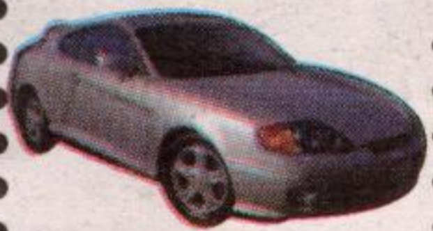
2003 HYUNDAI TIBURON SE