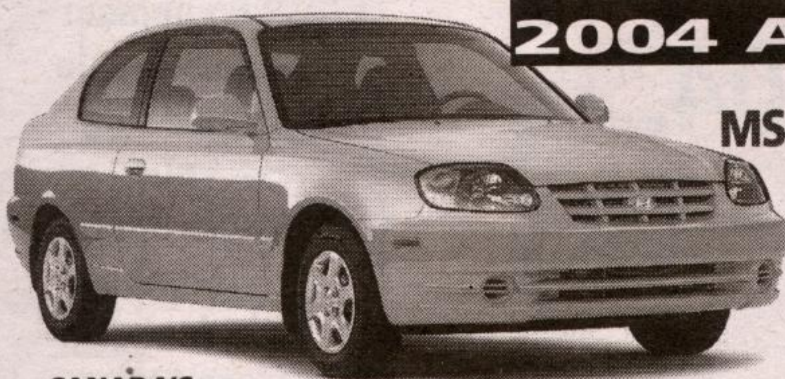
2004 ACCENT GS

MAKE YOUR DETOUR THROUGH ATTRELL & SAVE!