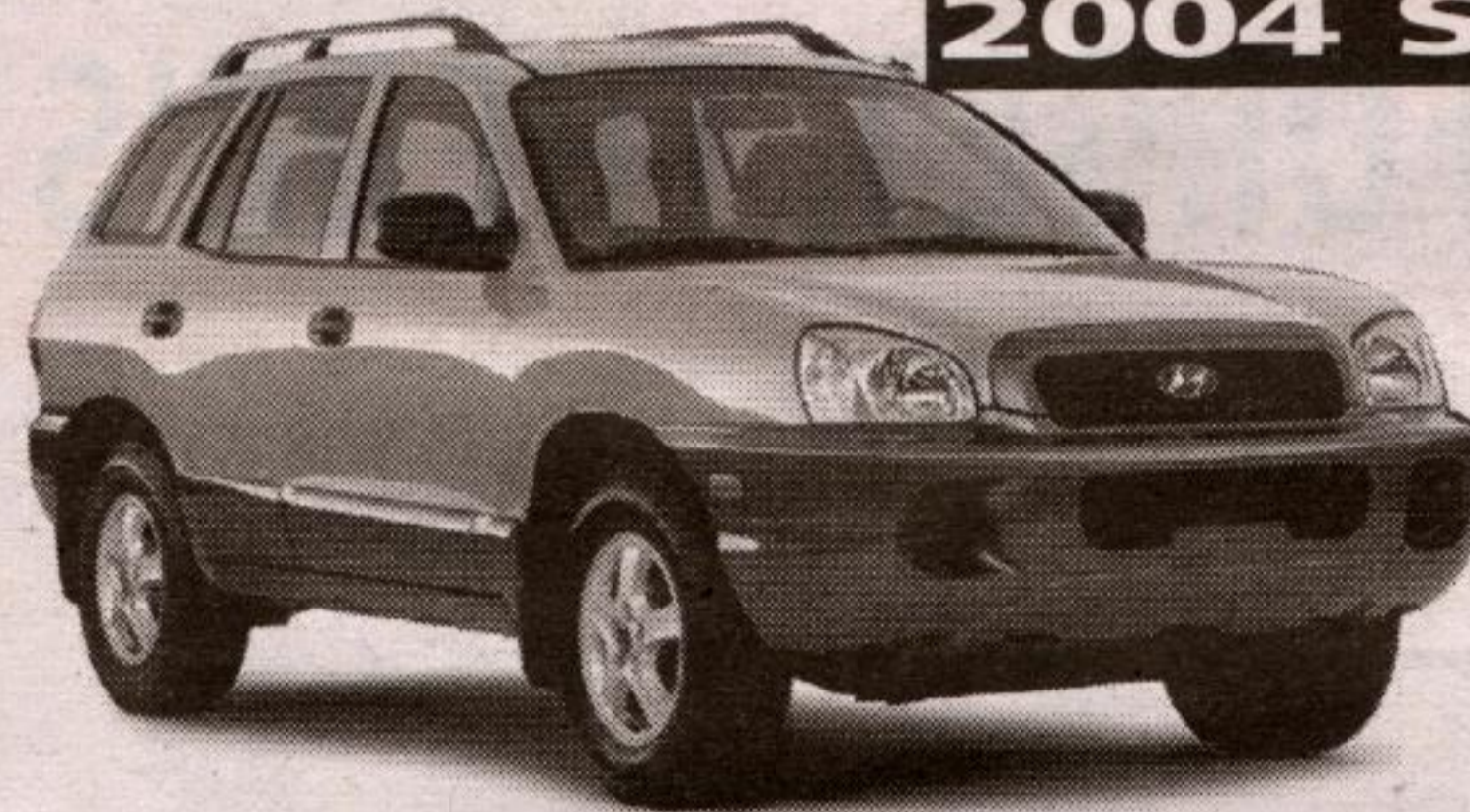
2004 SANTA FE GL

0% PURCHASE FINANCING UP TO 36 MONTHS* $0 DOWN PAYMENT