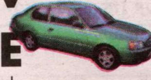
2000 HYUNDAI ACCENT GS