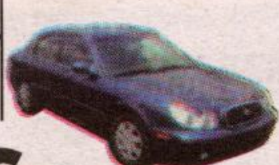
2002 HYUNDAI SONATA GL