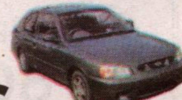
2001 HYUNDAI ACCENT GS