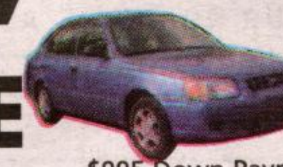
2000 HYUNDAI ACCENT GL