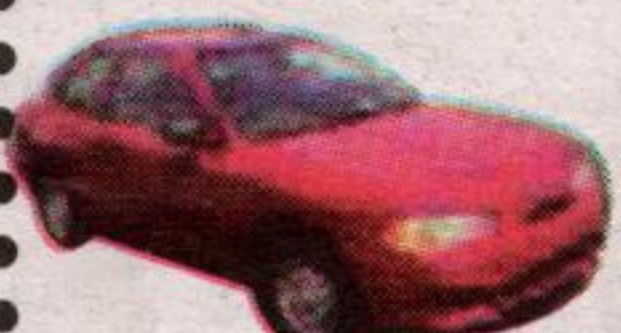
1999 HYUNDAI ACCENT L