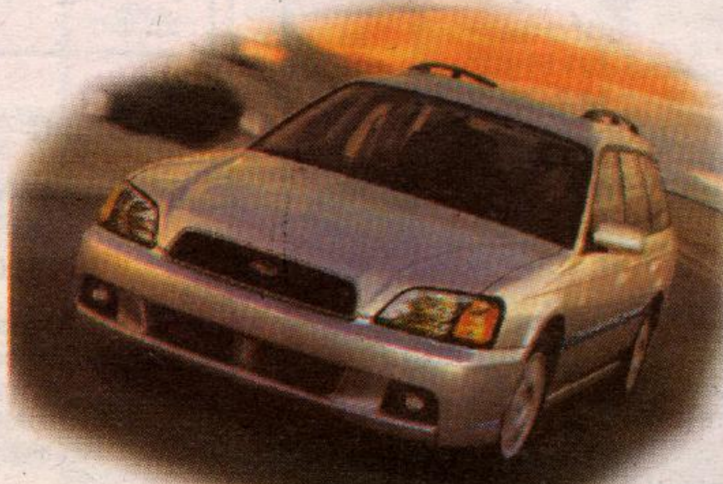
2004 LEGACY SPECIAL EDITION

LEASE FROM $368 ** PER MONTH $0 DOWN SECURITY DEPOSIT OR PURCHASE FINANCING FROM 2.8% MSRP $27,995 #1 Only vehicle in it's class to receive highest crash test safety rating*. INSURANCE INSTITUTE FOR HIGHWAY SAFETY