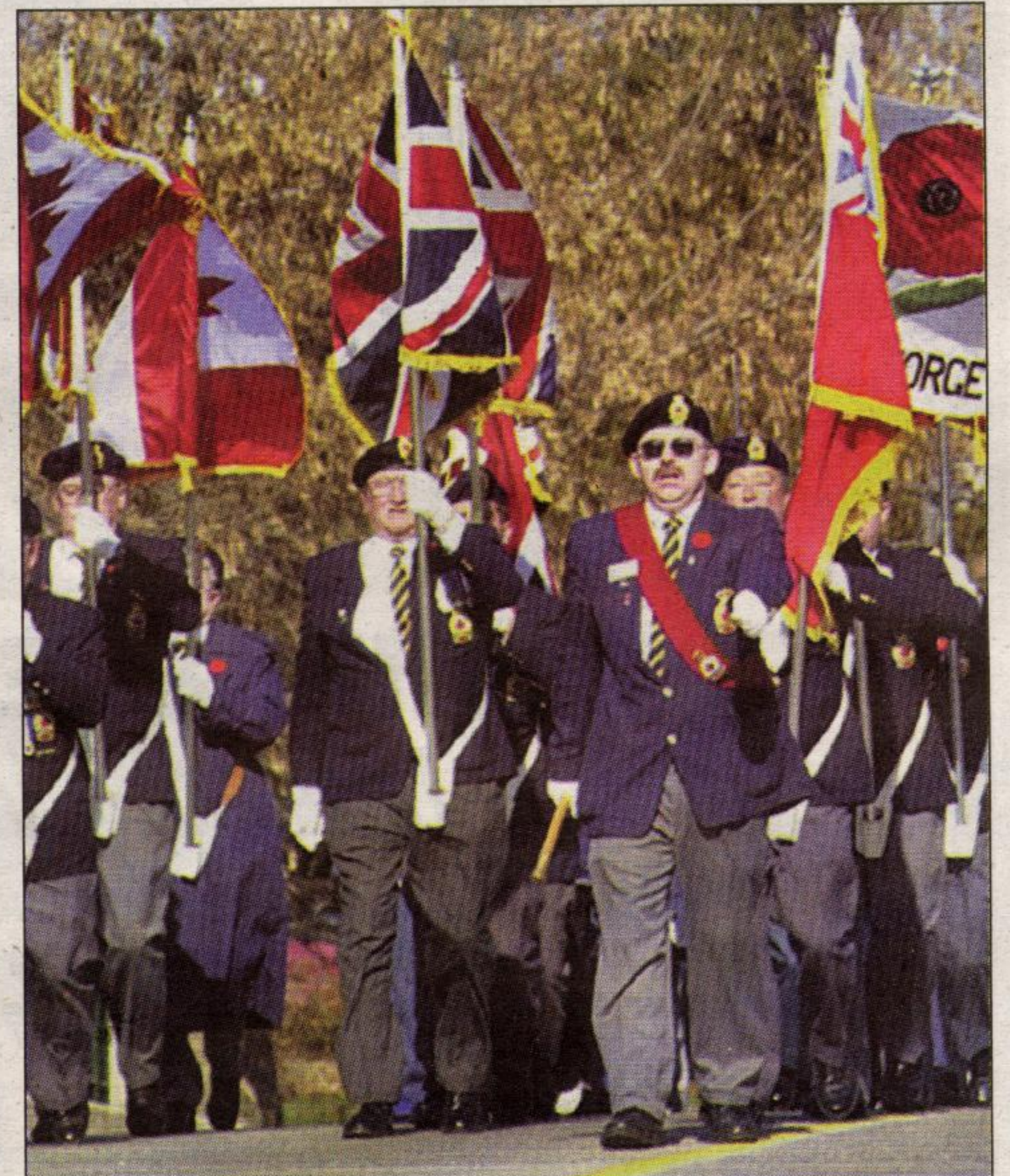
In picture perfect weather, Georgetown Legion colour party members marched across Glen Williams bridge on their way to the Glen Memorial.