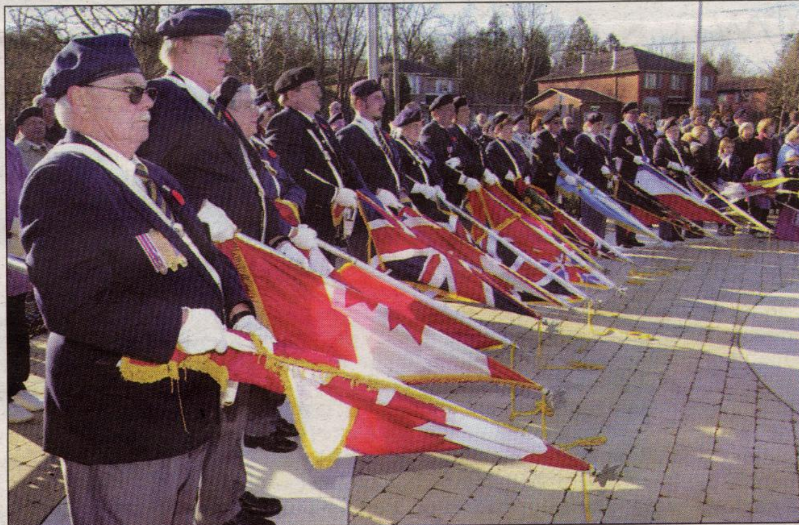
Royal Canadian Legion Branch 120 (Georgetown) colour party lowered their flags in honour of their fallen comrades at the Georgetown Cenotaph