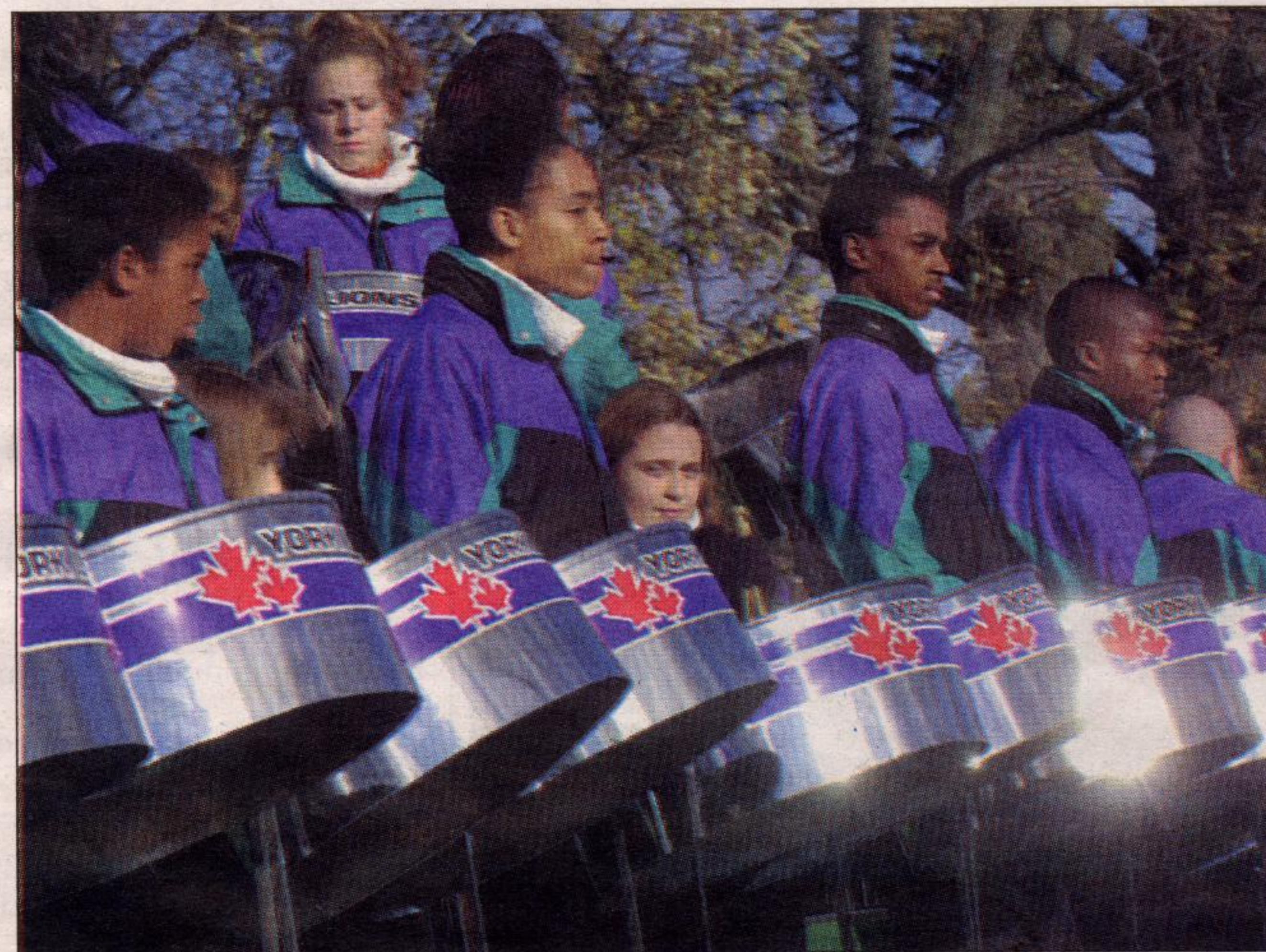
The York Lions Steel Band lent their unique sound to Christmas carols during Saturday's parade.