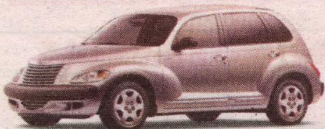
2003 PT Cruiser