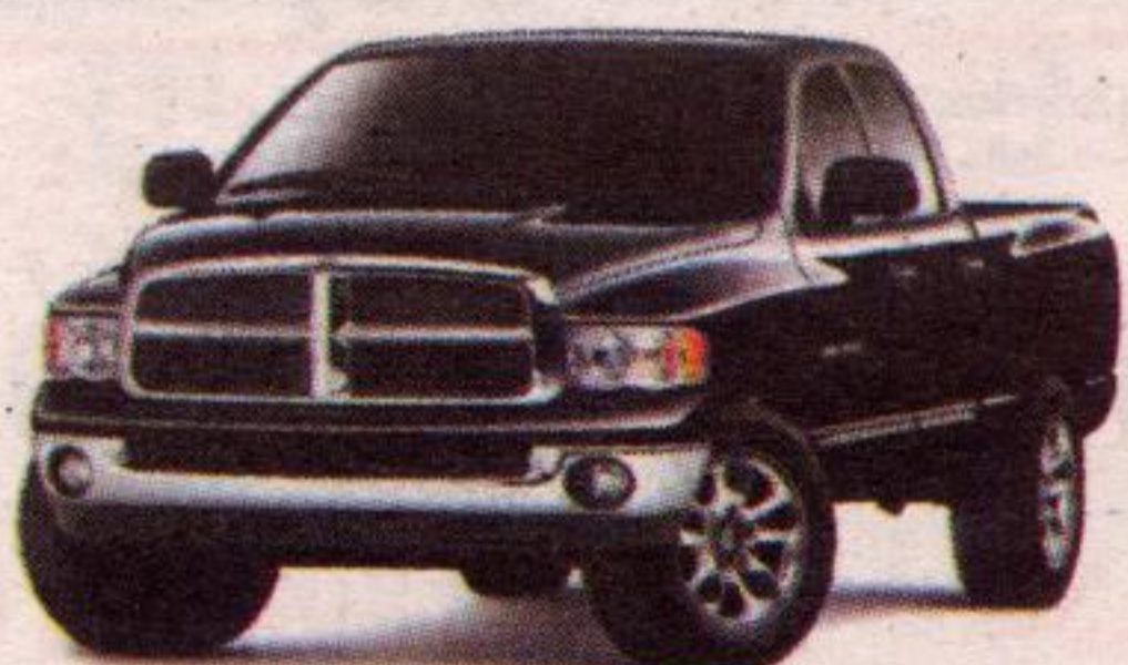
2004 Dodge Ram 1500

OR LEASE FOR $248 † /month for 48 MONTHS with $4,085 down payment or equivalent trade. Plus $895 freight. NO SECURITY DEPOSIT.