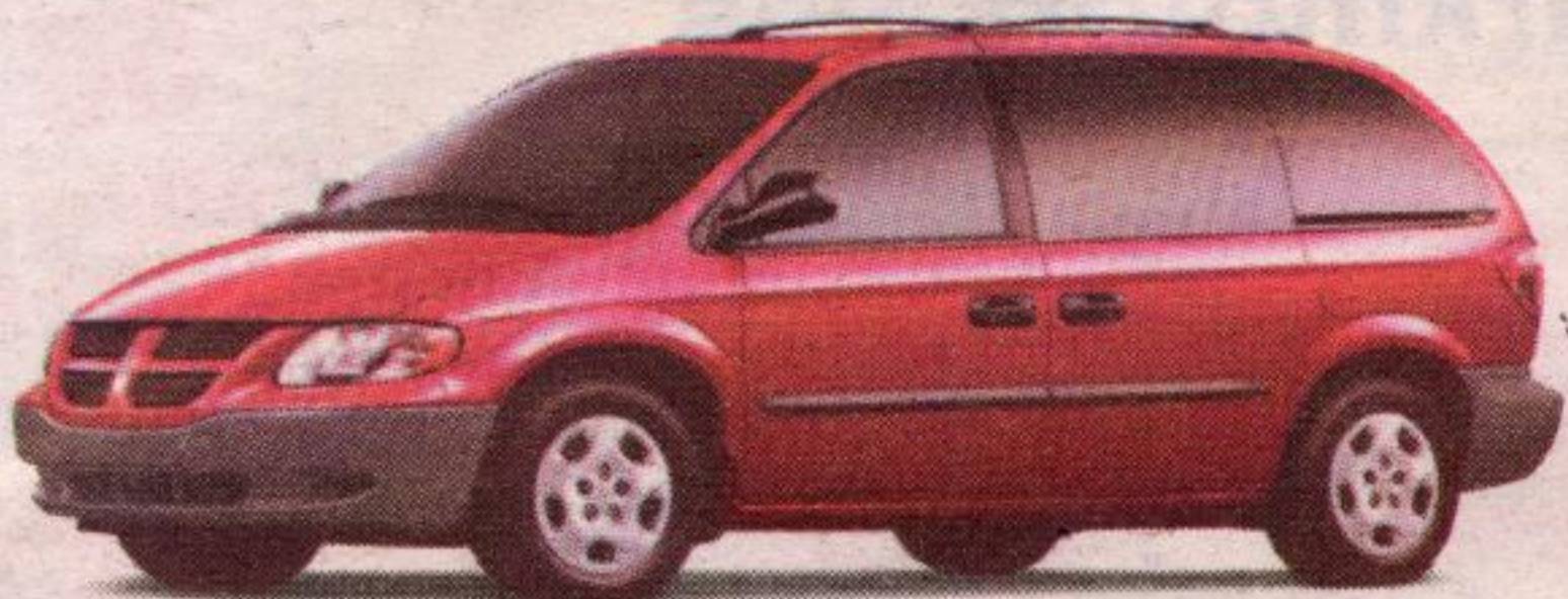
2003 Dodge Caravan SE

0% Purchase financing* for 72 MONTHS on all 2003 Dodge Caravan and Grand Caravan models.