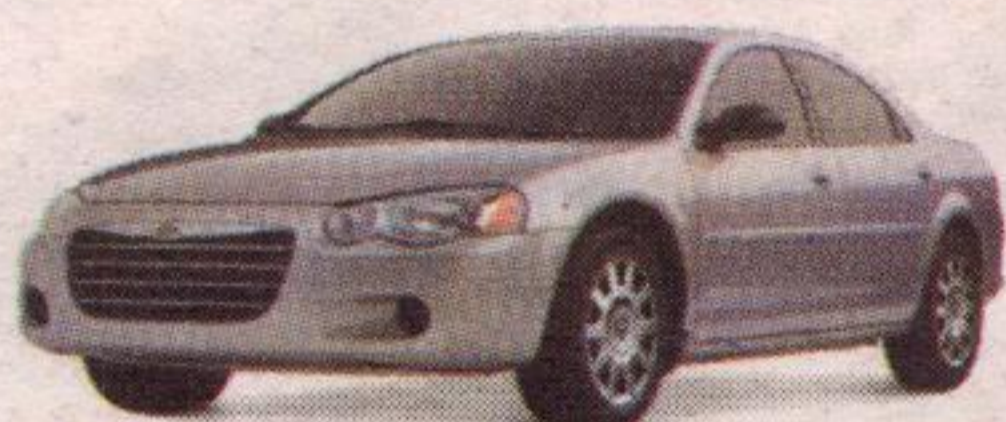
2004 Chrysler Sebring Sedan LX