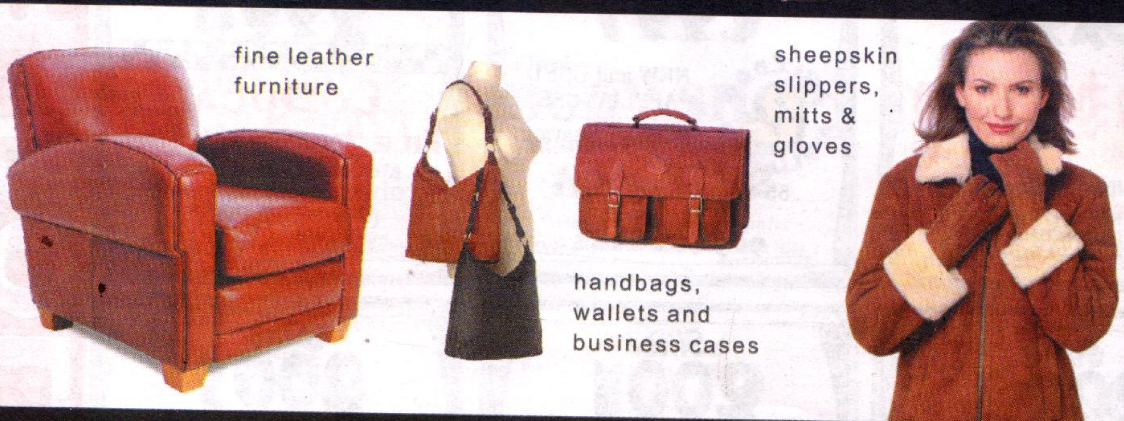
fine leather furniture