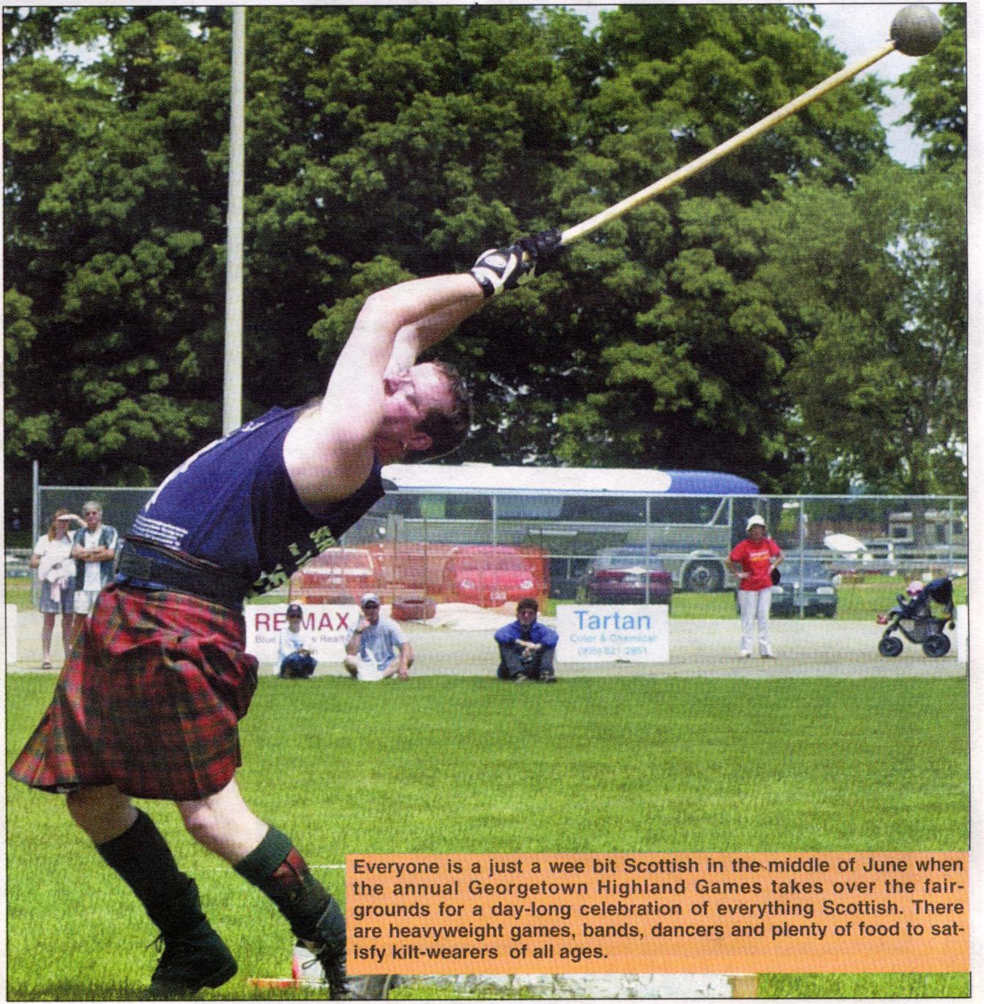
Everyone is a just a wee bit Scottish in the middle of June when the annual Georgetown Highland Games takes over the fairgrounds for a day-long celebration of everything Scottish. There are heavyweight games, bands, dancers and plenty of food to satisfy kilt-wearers of all ages.