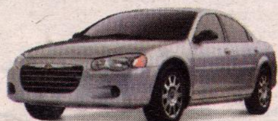
2004 Chrysler Sebring Sedan LX