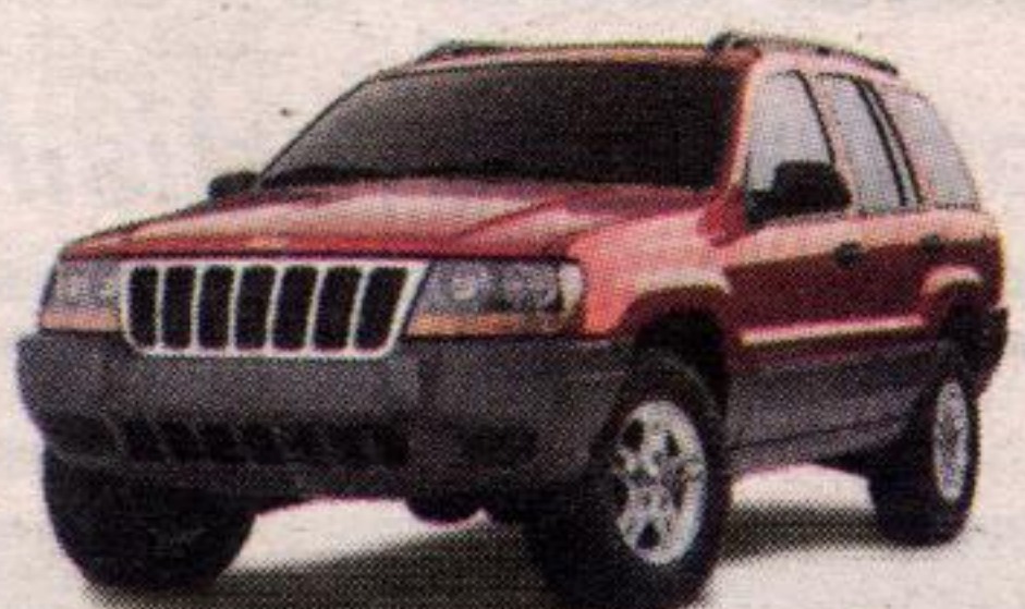
2004 Jeep Grand Cherokee

OR LEASE FOR $248 † /month for 48 MONTHS with $4,085 down payment or equivalent trade. Plus $895 freight. NO SECURITY DEPOSIT.