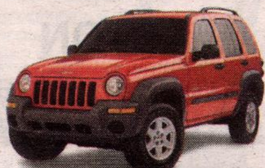
2003 Jeep Liberty Sport