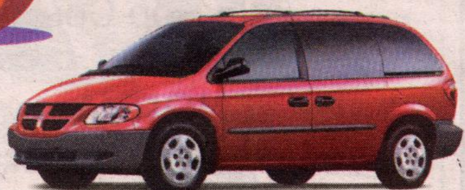
2003 Dodge Caravan SE

0% Purchase financing* for 72 MONTHS on all 2003 Dodge Caravan and Grand Caravan models.