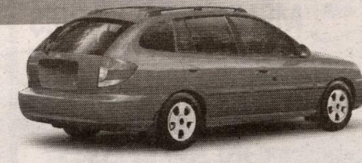
RX-V Convenience model shown

$169 PER MO. 60 MOS. LEASE FROM Only $2,100 Down Payment $0 SECURITY DEPOSIT OR 0% PURCHASE FINANCING FOR 60 MONTHS