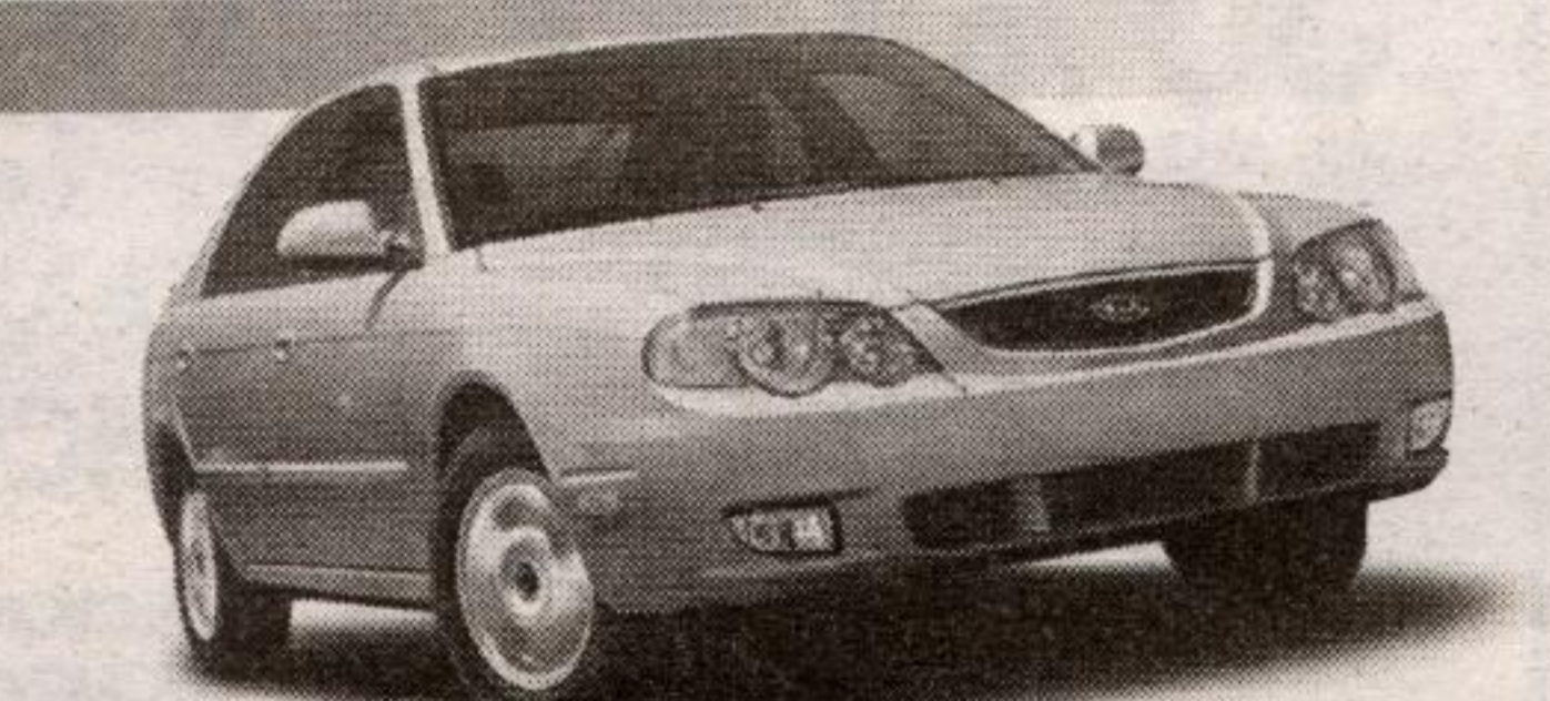
GSX model shown

$179 PER MO. 60 MOS. LEASE FROM Only $2,895 Down Payment $0 SECURITY DEPOSIT OR 0% PURCHASE FINANCING FOR 60 MONTHS