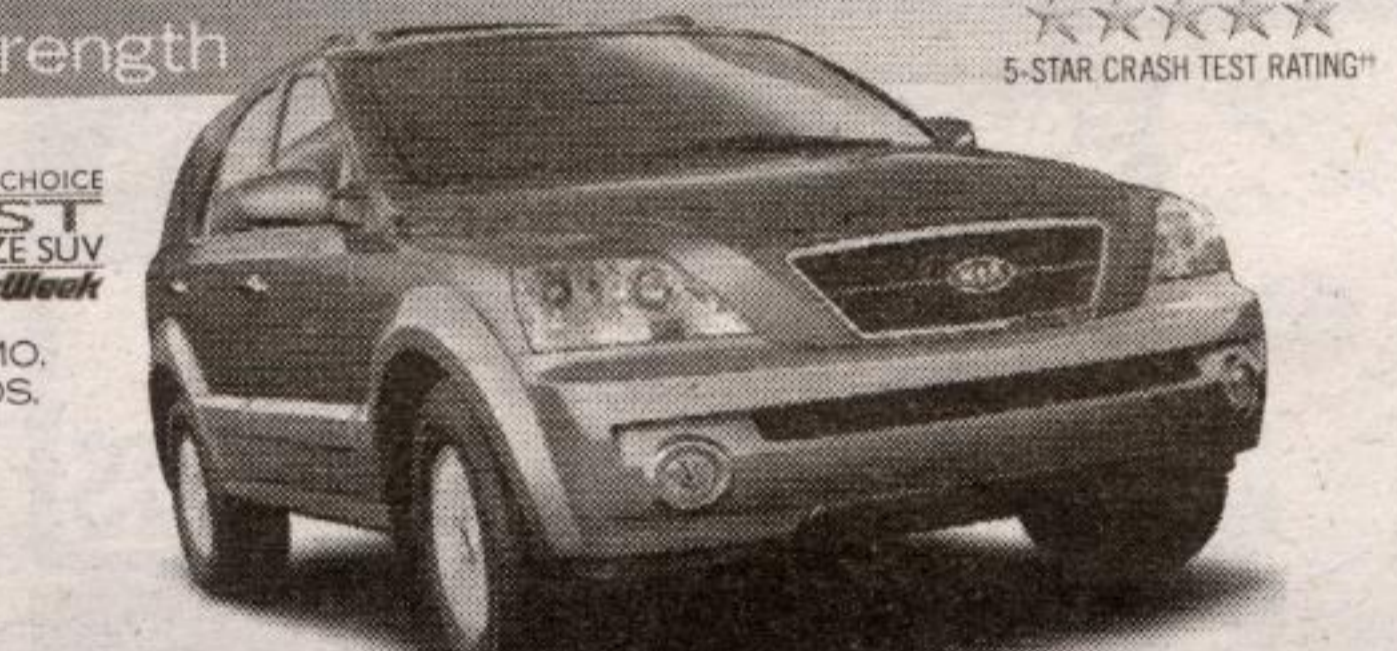
EX model shown

$322 PER MO. 60 MOS. LEASE FROM Only $4,750 Down Payment $0 SECURITY DEPOSIT OR 3.9% PURCHASE FINANCING