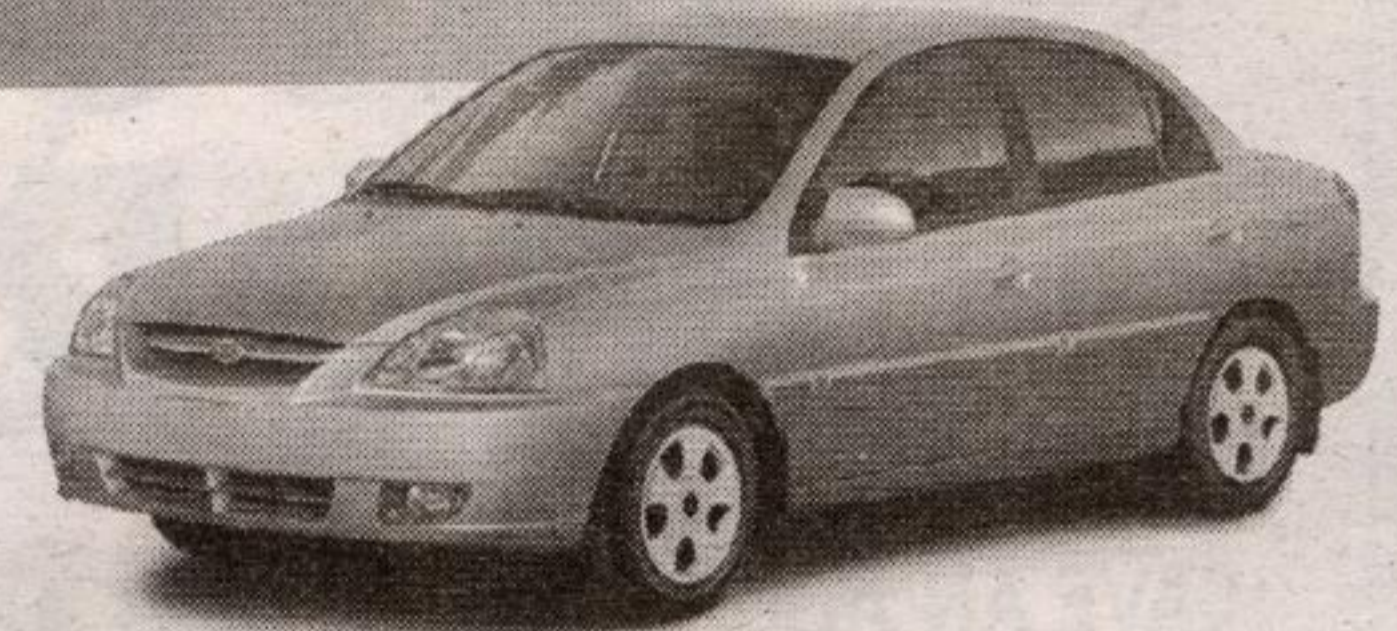
LS model shown

$139 PER MO. 60 MOS. LEASE FROM Only $1,695 Down Payment $0 SECURITY DEPOSIT OR 0% PURCHASE FINANCING FOR 60 MONTHS