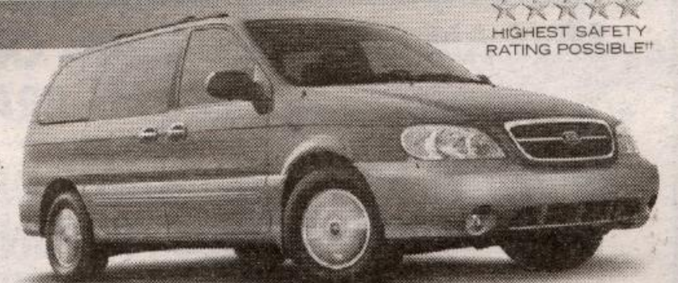
EX-L model shown

$249 PER MO. 60 MOS. LEASE FROM Only $4,850 Down Payment $0 SECURITY DEPOSIT OR 2.9% PURCHASE FINANCING