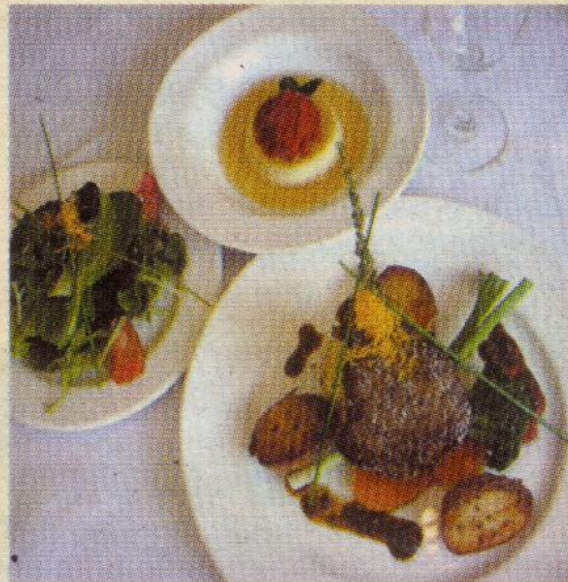
Above: Table d' Hote $20.00 Angus Sirloin Steak, Sm Salad and Dessert.

Lunch 11:30a.m.-2:30p.m. Dinner Sun to Thurs 5-10p.m. Fri and Sat 5-11p.m.