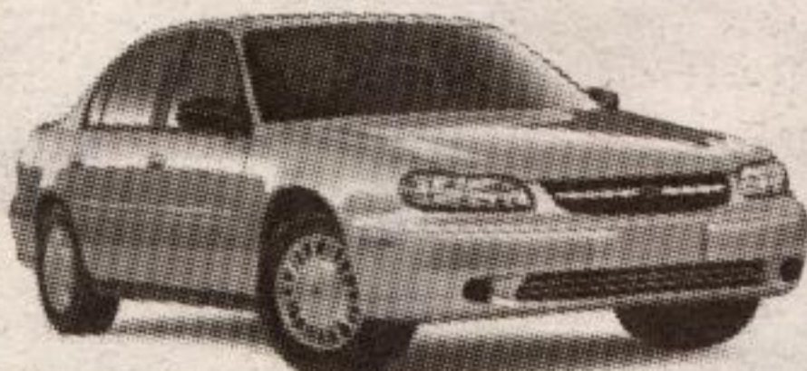
2003 CHEVROLET MALIBU

$5,350 OFF* PLUS $500 BONUS† CASH PURCHASE PRICE