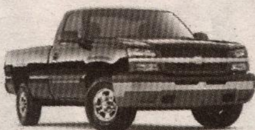
2003 CHEVY SILVERADO

$2,000 OFF* PLUS $500 BONUS† CASH PURCHASE PRICE