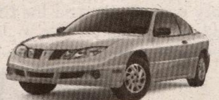
2003 PONTIAC SUNFIRE

$4,500 OFF* PLUS $500 BONUS† CASH PURCHASE PRICE