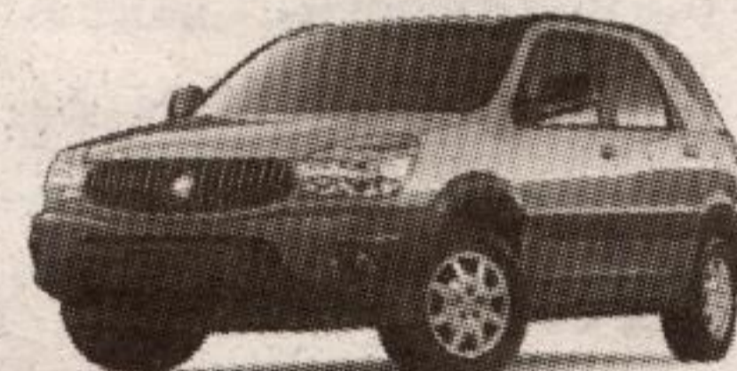
2003 BUICK RENDEZVOUS

$3,000 OFF* PLUS $500 BONUS† CASH PURCHASE PRICE