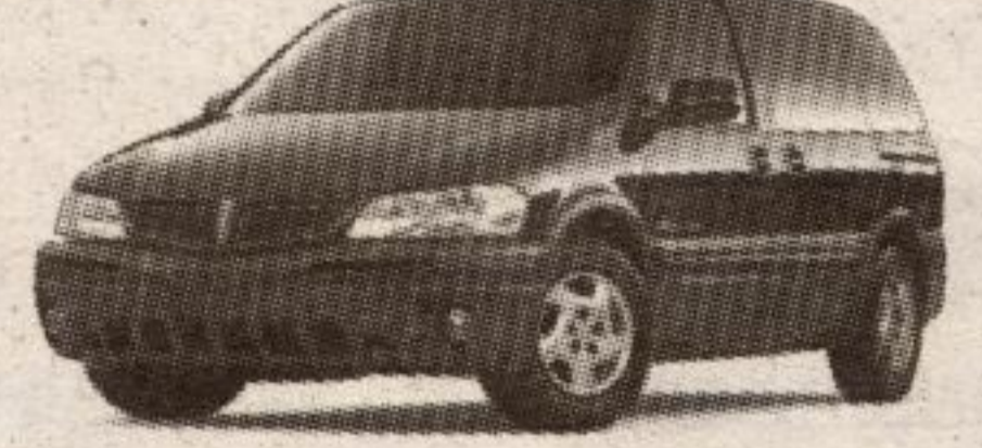
2003 PONTIAC MONTANA

$6,500 OFF* PLUS $500 BONUS† CASH PURCHASE PRICE