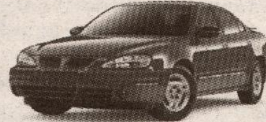
2003 PONTIAC GRAND AM

$4,600 OFF* PLUS $500 BONUS† CASH PURCHASE PRICE