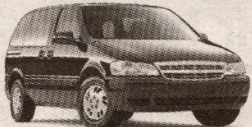
2003 CHEVROLET VENTURE

$6,500 OFF* PLUS $500 BONUS† CASH PURCHASE PRICE