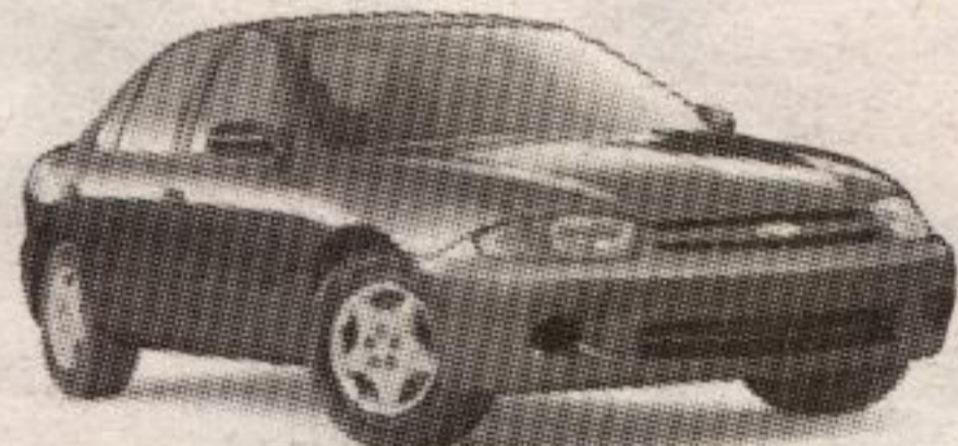
2003 CHEVROLET CAVALIER

$4,500 OFF* PLUS $500 BONUS† CASH PURCHASE PRICE