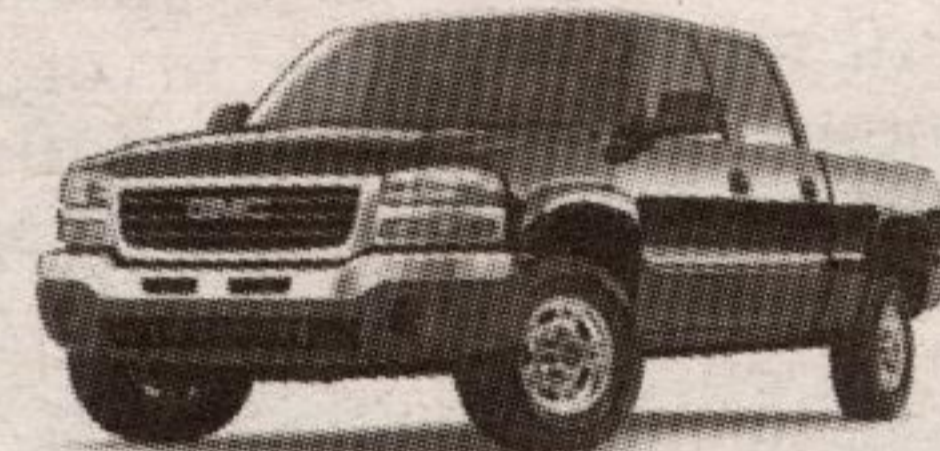
GMC 2003 SIERRA

$2,000 OFF* PLUS $500 BONUS† CASH PURCHASE PRICE