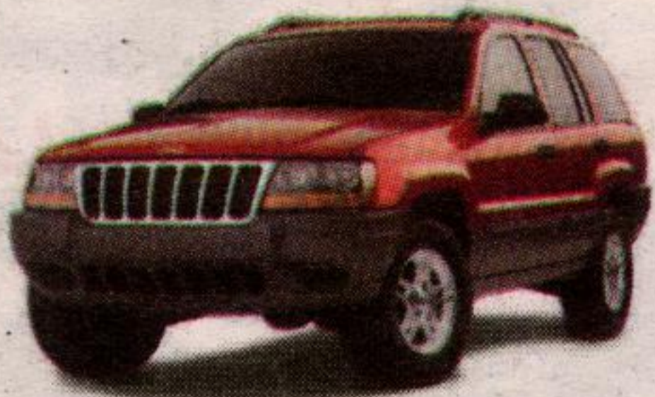
2004 Jeep Grand Cherokee

OR LEASE FOR $248 † /month for 48 MONTHS with $4,085 down payment or equivalent trade. Plus $895 freight. NO SECURITY DEPOSIT.