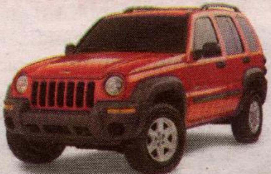
2003 Jeep Liberty Sport