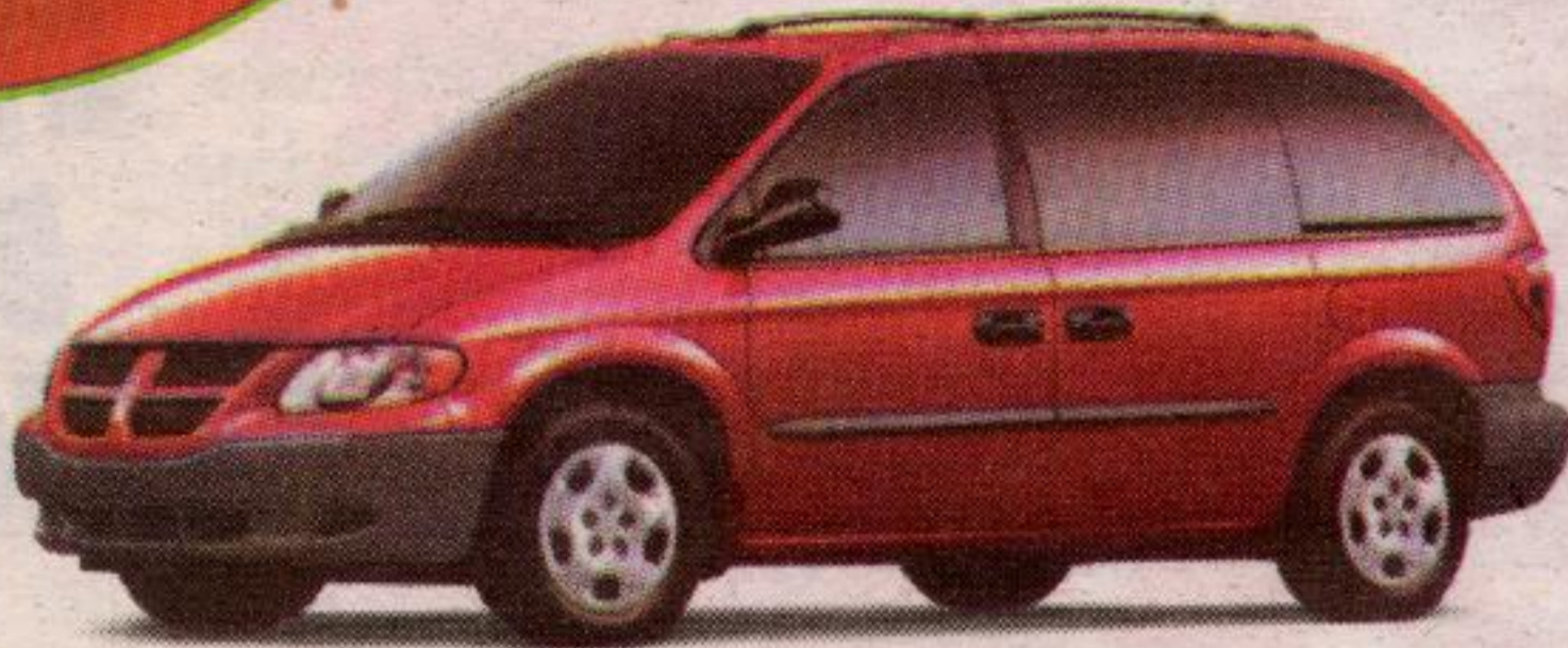
2003 Dodge Caravan SE

0% Purchase financing* for 72 MONTHS on all 2003 Dodge Caravan and Grand Caravan models.