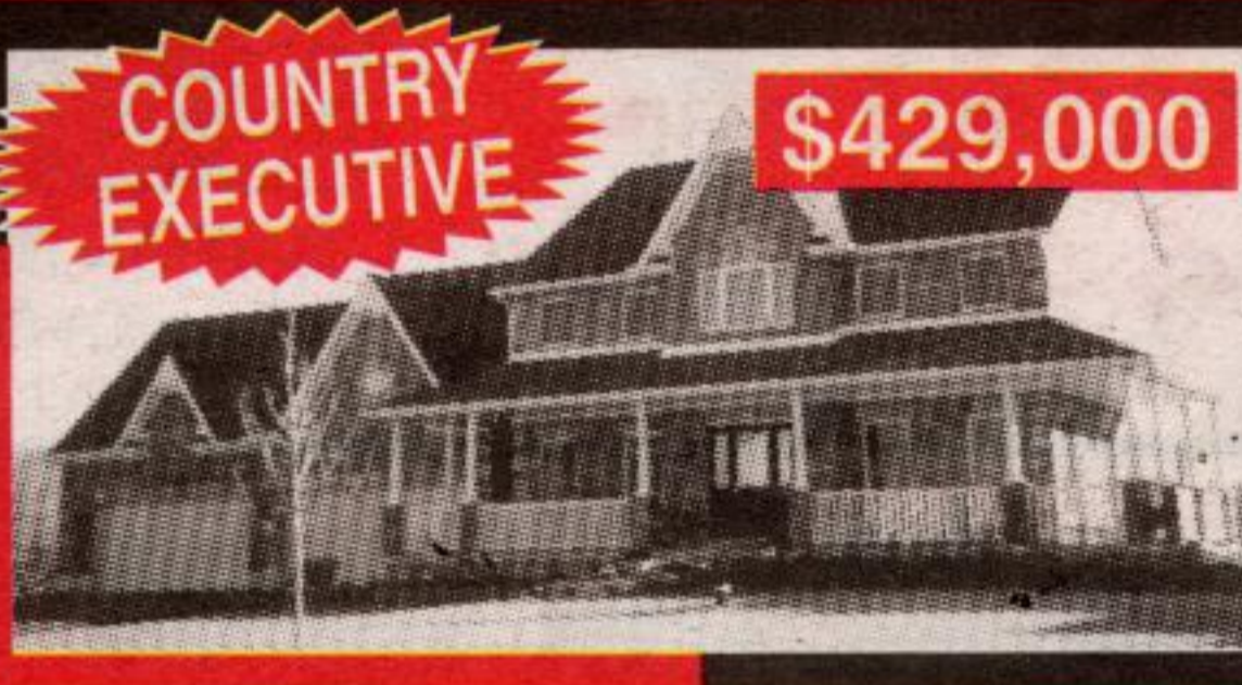
COUNTRY EXECUTIVE $429,000

Near the Grand River with quaint raised bungalow. Walkout from finished basement. Beautiful rolling scenic land. Ideal for horses. Call Wayne Baguley* (519) 941-5151 or (905) 450-3355.