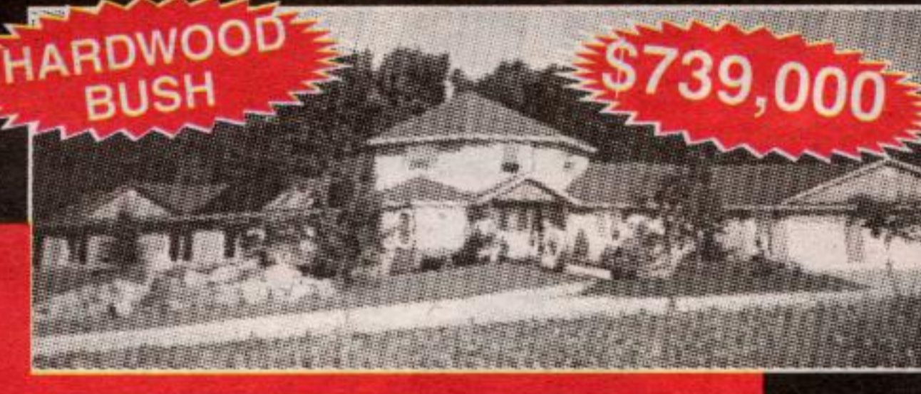
HARDWOOD BUSH $739,000

4-1/2 Manicured acres, gardens, 2 ponds, heavily treed, small hobby barn, 3 bedroom immaculate raised bungalow. Open concept. Large deck with screened sun porch. Gorgeous family room with FP. Finished rec rm in bsmt plus spa. 2 walkouts. Lots of windows. Easy commute. Must see. Call Wayne Baguley* (519) 941-5151 or (905) 450-3355.