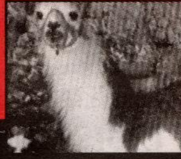
"ROMEO" THE LLAMA