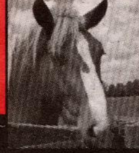
"CHIEF" THE BELGIAN DRAFT HORSE 17 HANDS