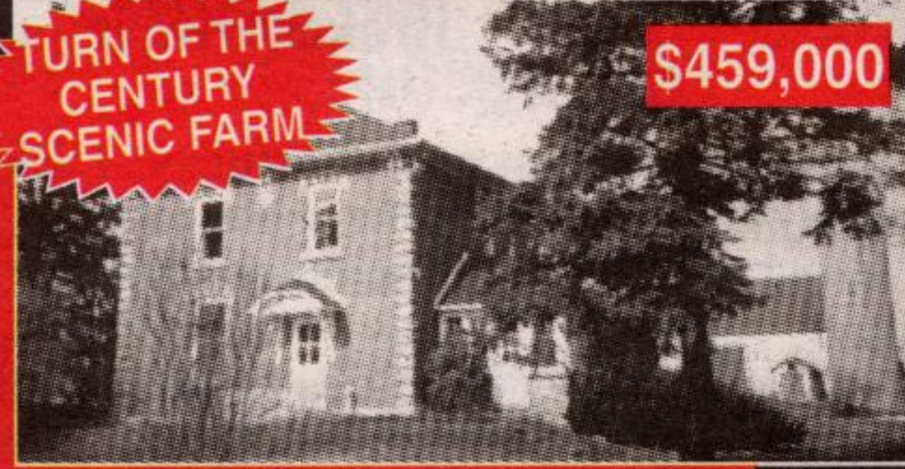
TURN OF THE CENTURY SCENIC FARM $459,000