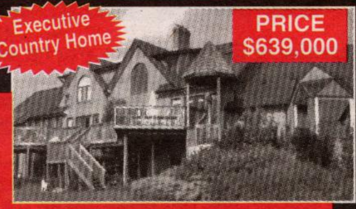
Executive Country Home PRICE $639,000

Georgian home in the heart of town on Main St. Original floors, trim, window sills, stone porch, brick & board & batten exterior. Beautifully remodeled large country kitchen, large mature lot, gazebo and rock garden. Single garage plus studio. $359,000. Call Wayne Baguley* (519) 941-5151 or (905) 450-3355.