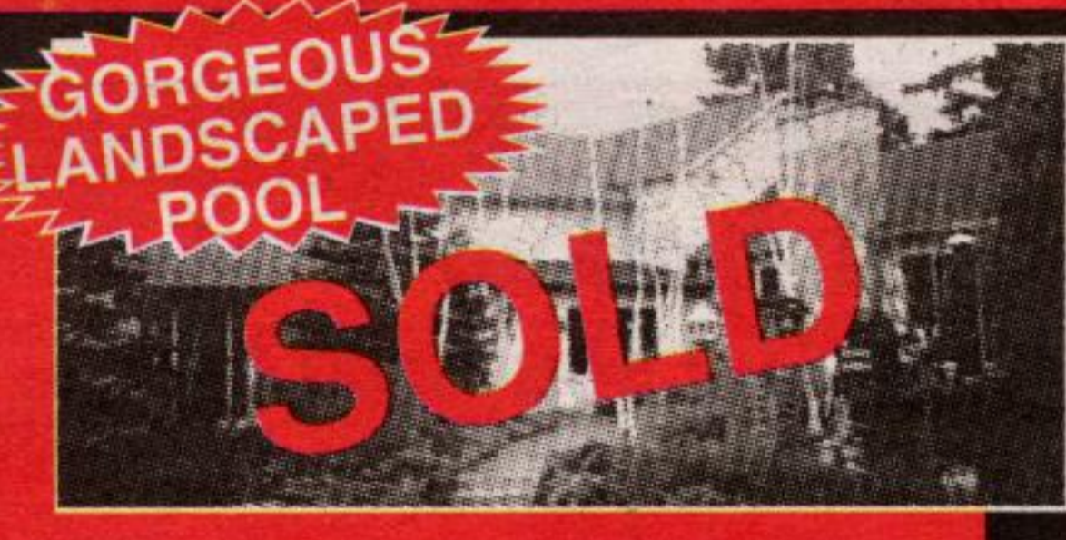
GORGEOUS LANDSCAPED POOL SOLD

2-1/2 acre, mature lot. Beautifully landscaped with contemporary stone home ideal for entertaining. Gorgeous hardwood floors throughout. Towering cathedral ceiling. Large loft/games room. Truly a must to see. 3000 sq. ft. deck with inground pool. $499,000. Call Wayne Baguley* (519) 941-5151 or (905) 450-3355.