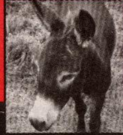
"NIFTY" THE MINIATURE DONKEY