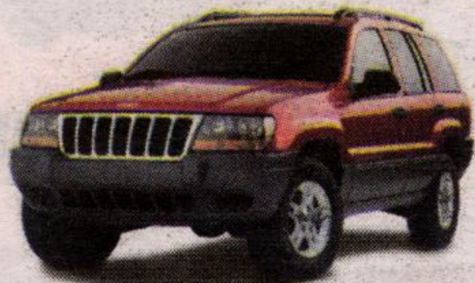
2004 Jeep Grand Cherokee

OR LEASE FOR $248 † /month for 48 MONTHS with $4,085 down payment or equivalent trade. Plus $895 freight. NO SECURITY DEPOSIT.