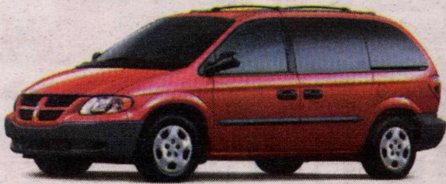
2003 Dodge Caravan SE

0% Purchase financing* for 72 MONTHS on all 2003 Dodge Caravan and Grand Caravan models.