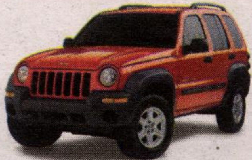
2003 Jeep Liberty Sport