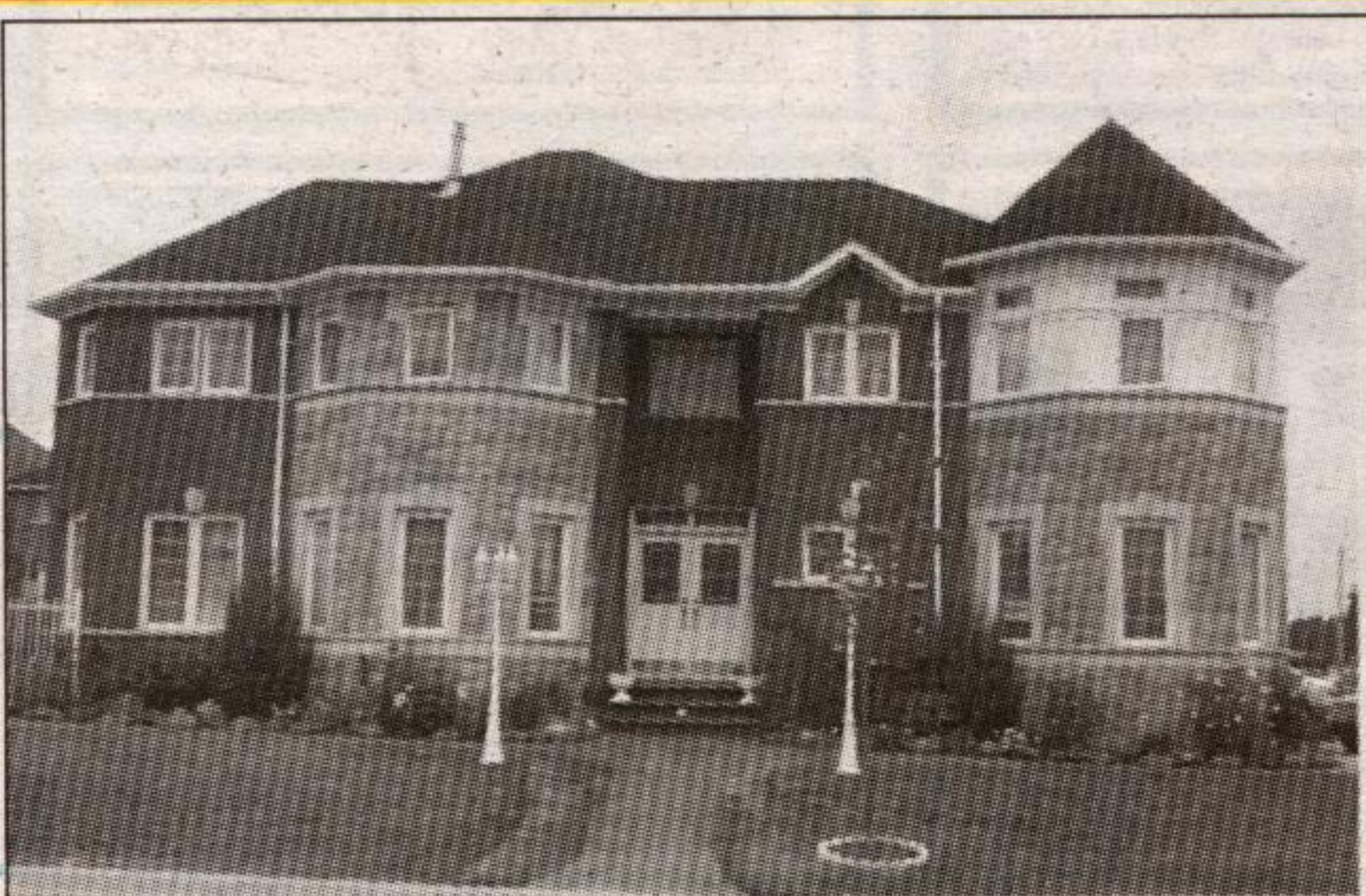
GREAT IN-LAW POTENTIAL

This impeccably maintained Fernbrook Waterford model has 2640 sq. ft. of bright open space plus a very large basement with separate entrance just waiting to be finished. Sit and relax by the self maintaining heated in-ground pool surrounded by beautiful landscaping and patterned concrete decking. This home also features a beautiful Master bedroom with a large walk-in closet, sitting room and a sparkling 5 pc. ensuite.