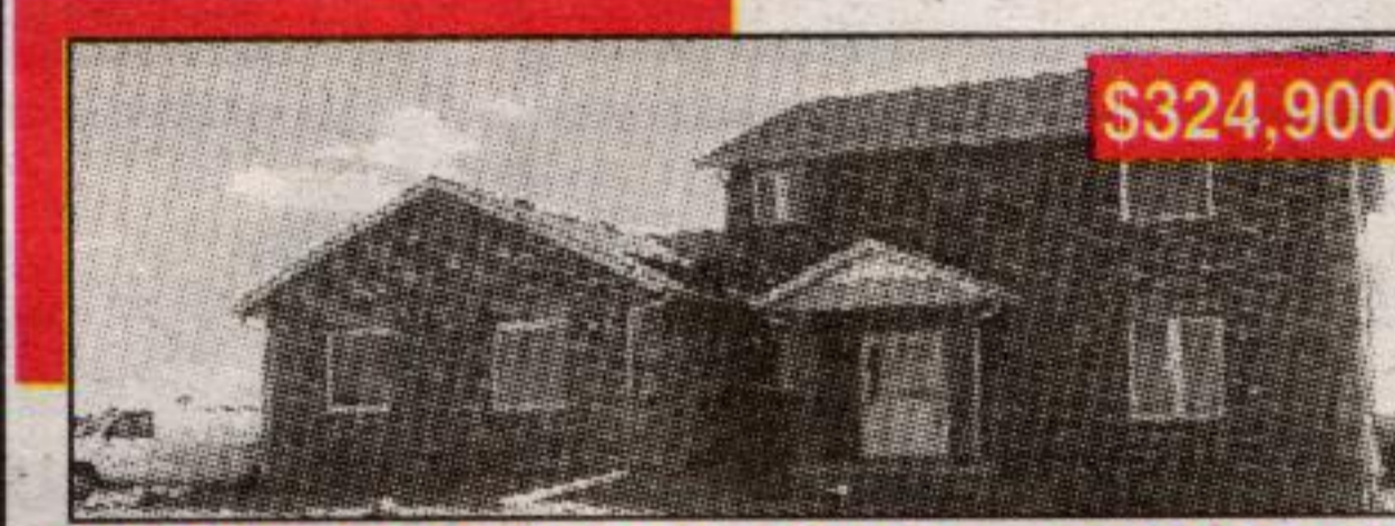
NEW EXECUTIVE HOME - BELWOOD

1.26 acre estate executive property overlooking Lake Belwood. 3+1 bedrooms, 4 baths, 4 car garage, long list of extras & upgrades. An excellent family "executive" home and an easy commute to Mississauga, Brampton or Metro.