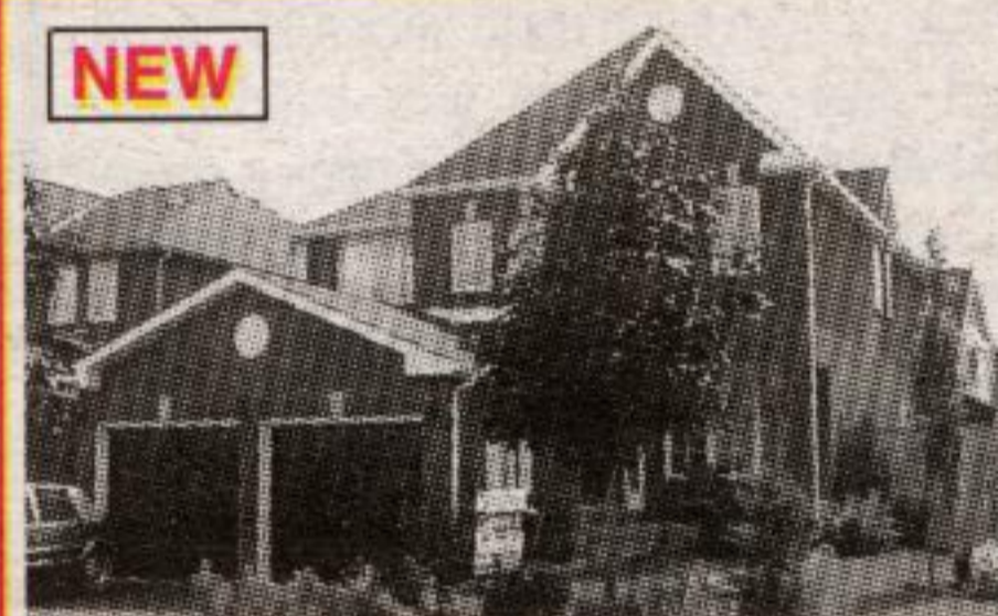
GEORGETOWN SOUTH BEAUTY - $389,900

4 level sidesplit with 4 bedrooms, 2 baths. Main floor family room with woodstove and walkout to fenced pool-sized backyard with mature trees. Quiet cul-de-sac location. Remodeled kitchen with walkout to deck. Finished rec room in basement. Located close to schools and park. You won't be disappointed. Call Norm Paget* to view.