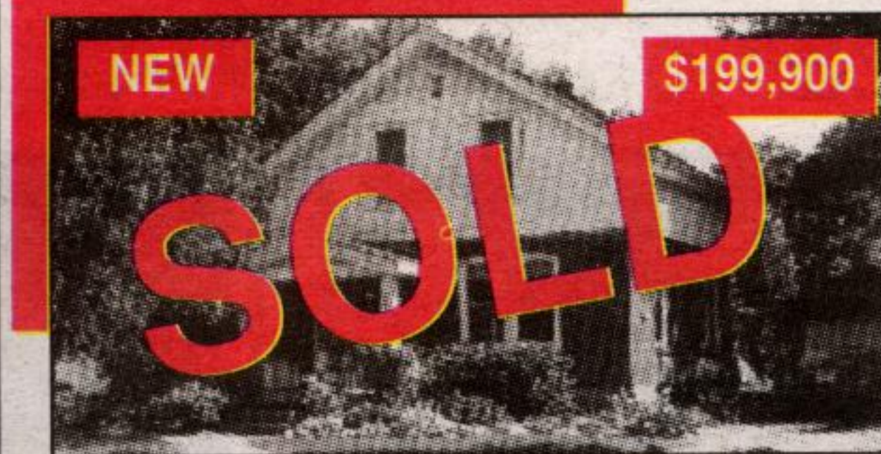
214 MAIN STREET, ROCKWOOD

and updated century home. 4 bedrooms, 2 baths. Updates include: Kitchen, baths, electrical, plumbing, roof, siding & patio. Excellent starter home. Close to downtown and minutes to 401.