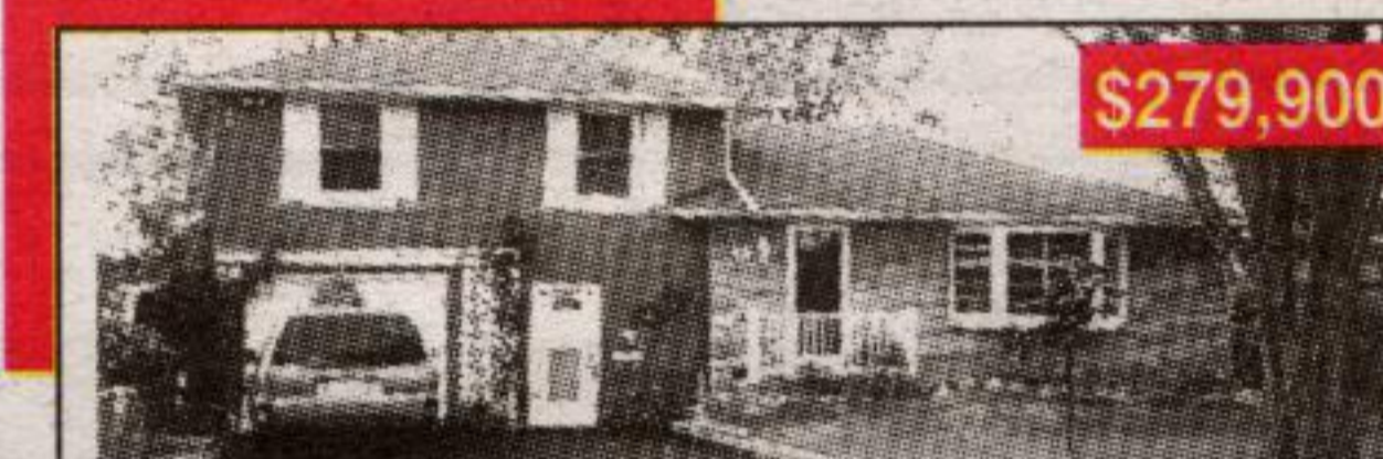
GEM IN OLD UNIVERSITY - 97 DEAN AVE.

Home on .75 acre lot. Long list of upgrades & extras incl. 5 pc. ensuite, custom kitchen w/granite counter tops, ceramic & hardwood & much more.