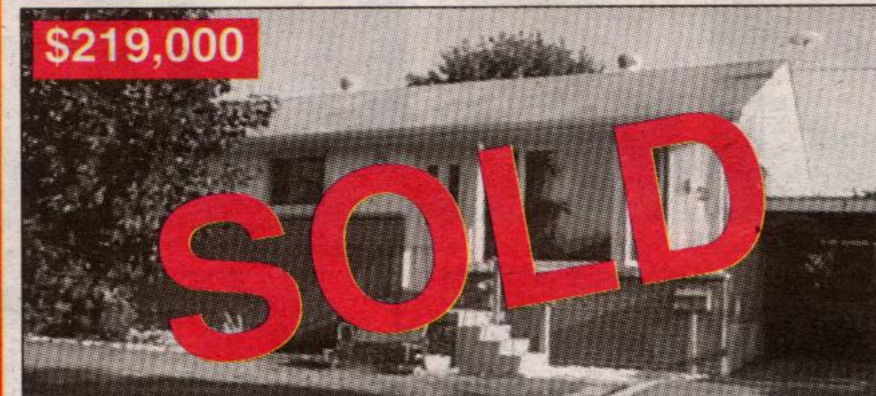
JUST MOVE IN!

Great 3 BR family home. Prof. installed main. free inground irrigation system, newly landscaped. New ceramics in kitchen & breakfast. Prof. finished basement w gas fireplace. Appliances included. Ready to move in & enjoy. Only $249,000. Call SANDRA BRIANCEAU* for an appointment. 03-575-30