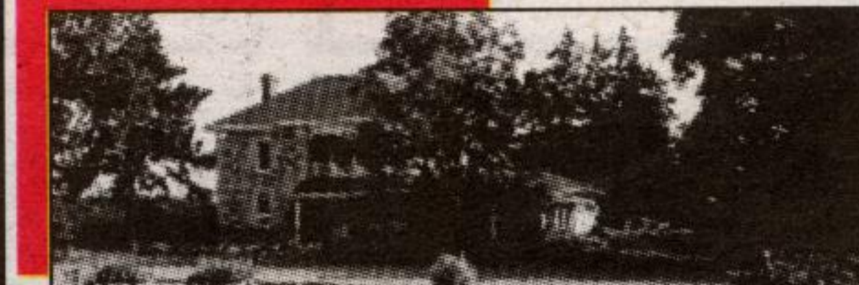
CENTURY STONE - 99 ACRES

Totally updated 3+1 bedroom, 3 bath sidesplit w/new family room addition. Huge 60x169 fully fenced lot. A must see.