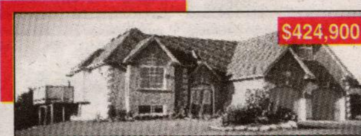
ESTATE HOME - BELWOOD

Charming and updated 3 bedroom home. Hardwood floors, newer windows, electrical, plumbing and furnace. Detached workshop/garage heated and insulated. Call Alan McPhedran* .