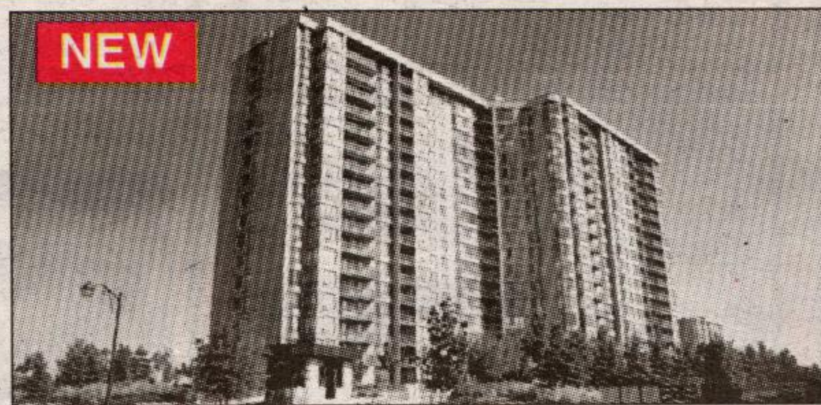
ONE OF BRAMPTON'S FINEST

This 1537 sq. ft. unit is truly a rare find. The unit offers an ensuite laundry/storage room, solarium with marble flooring, large master bedroom with 4 pc ensuite, beautiful kitchen with upgraded oak cabinets, ceramics and a bright breakfast area. Perfectly located by the 401, 407 and 403. Call SANDRA BRIANCEAU* for your personal viewing. 03-581-19