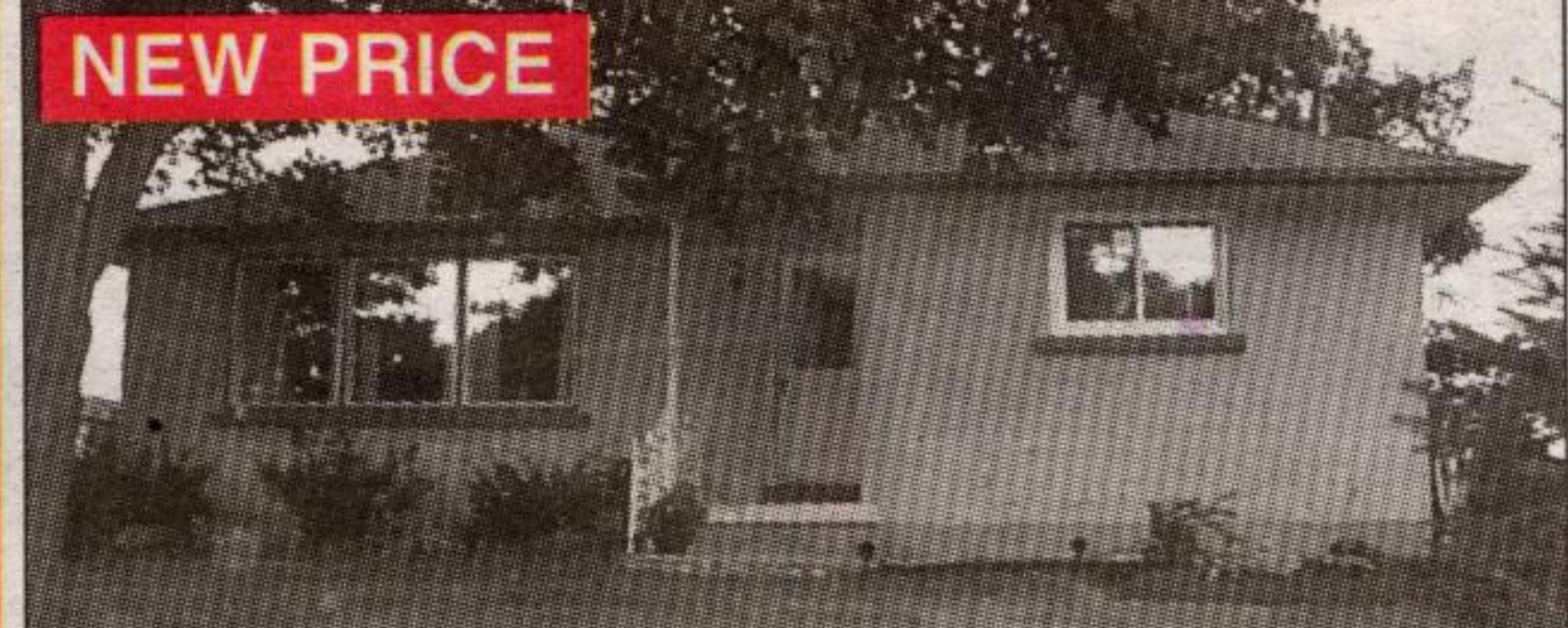
BUNGALOW IN ERIN

OPEN HOUSE - SUN., OCT. 12 - 1-3 P.M. 219 DANIEL STREET, ERIN