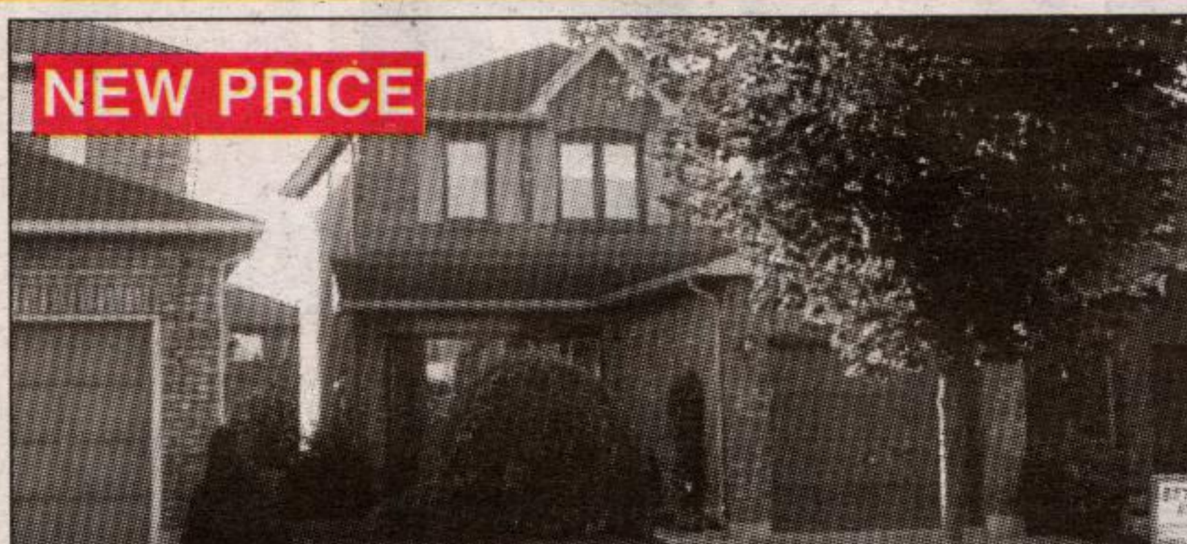
POPULAR STARTER HOME

Just $199,900. gets you a great 3 bedroom bungalow with a large beautiful lot. Located close to Public and High Schools, Arena, Theatre, Tennis Courts and historical downtown Erin. New windows (except Bay), doors, shingles, furnace and updated kitchen and bathroom top this beauty off. Don't miss out, these don't come along very often. Call SANDRA BRIANCEAU* today. 03-564-91