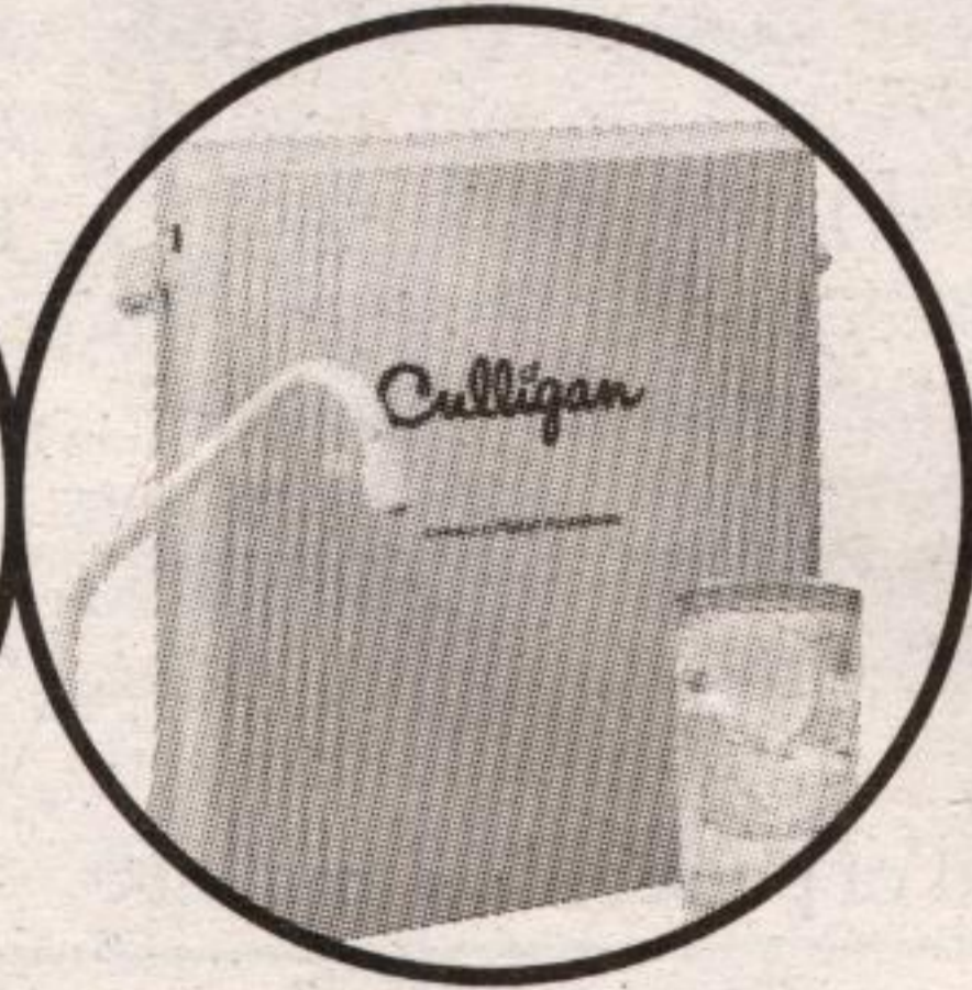
Culligan Water Tower Drinking Water System

RENT and the first three months are Free BUY and pay no interest for 12 months and get free installation*