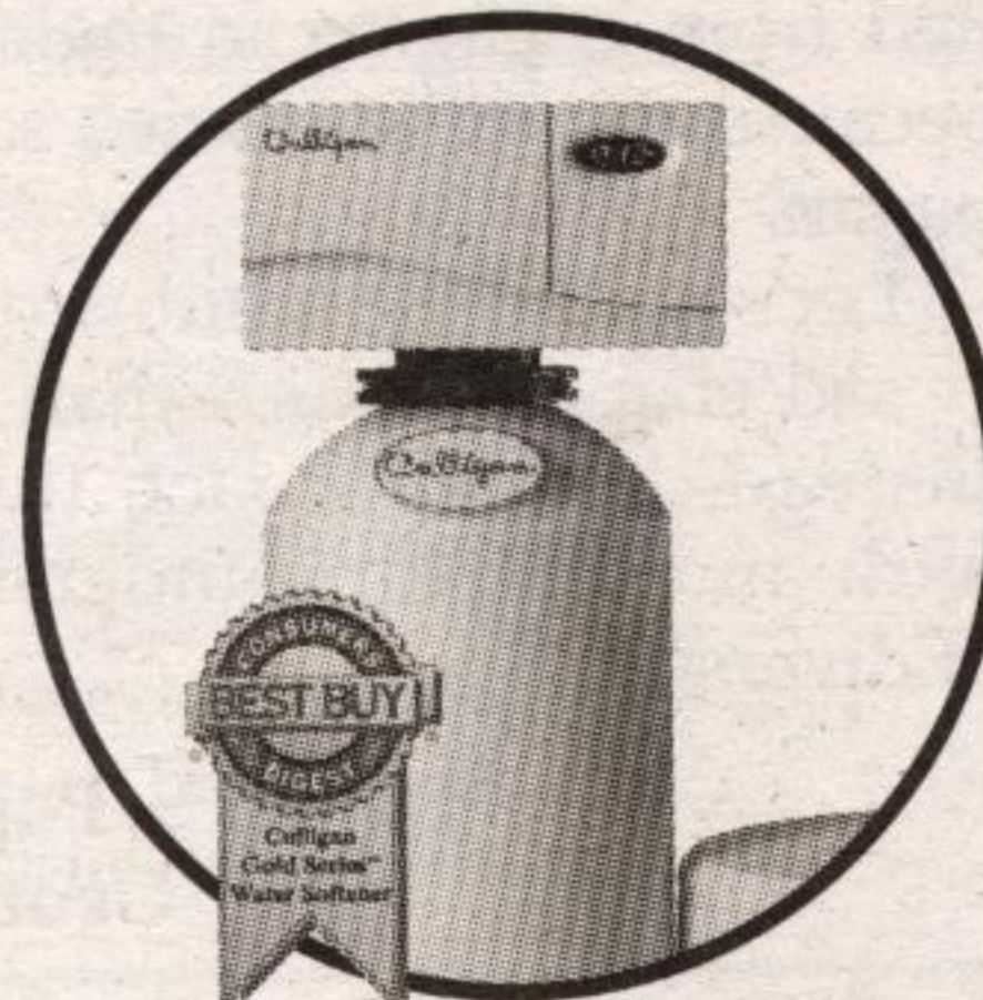
Culligan Gold Aqua-Sensor Water Conditioner