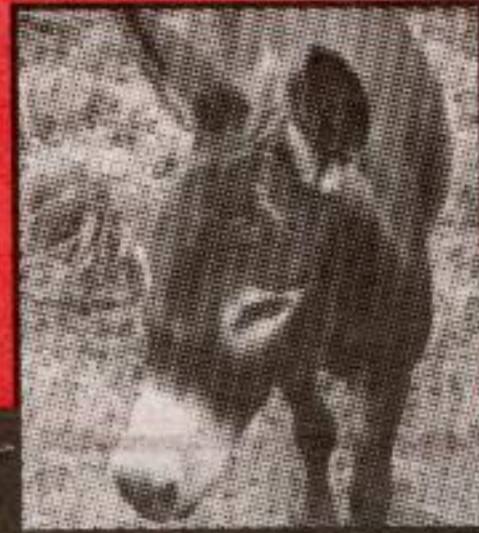
"NIFTY" THE MINIATURE DONKEY

ROYAL LEPAGE RCR Realty, BROKER INDEPENDENTLY OWNED AND OPERATED