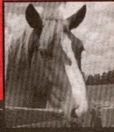
"CHIEF" THE BELGIAN DRAFT HORSE 17 HANDS