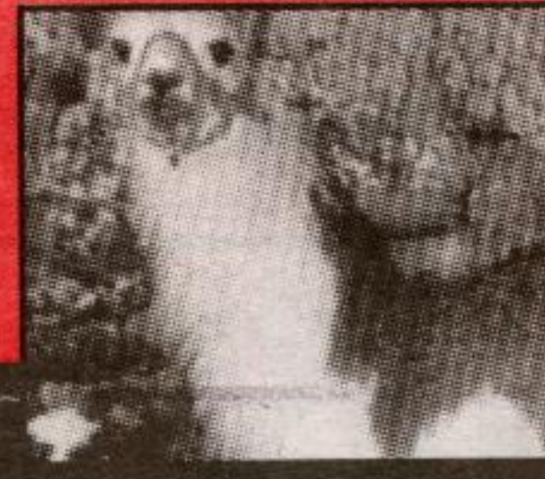
"ROMEO" THE LLAMA