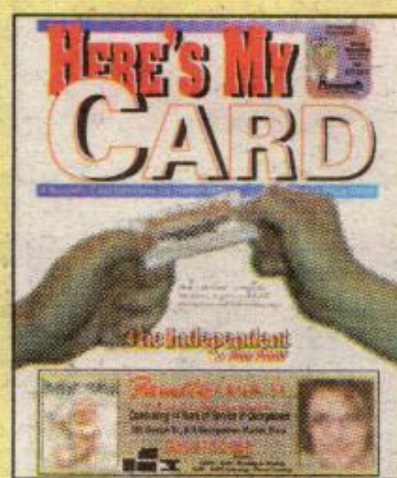
Here's My Card ...36 pg. section