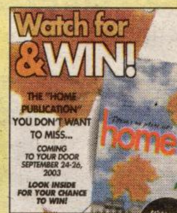
For Your Home ...24 pg. section