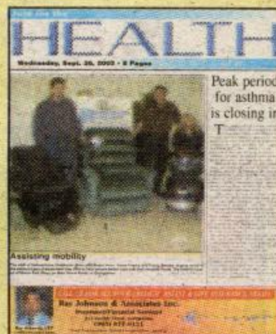
Just for the Health of It ...8 pg. section