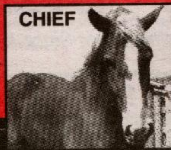
CHIEF BELGIAN DRAFT HORSE 17 HANDS