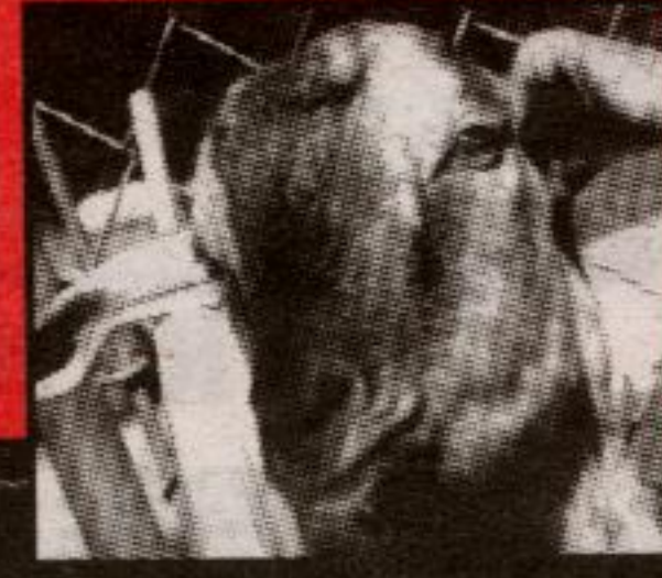
SPIKE THE GOAT