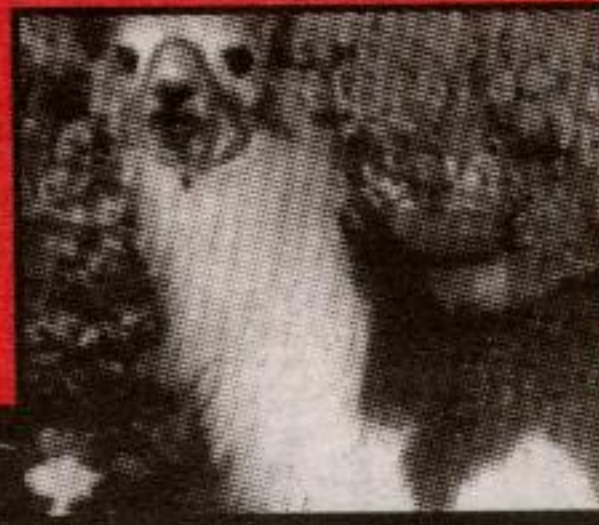
ROMEO THE LLAMA