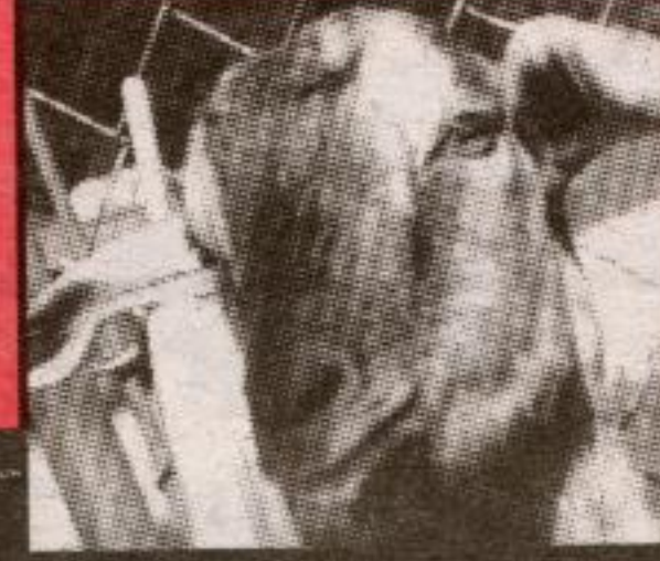
SPIKE THE GOAT