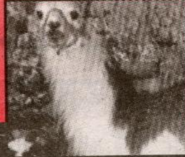
ROMEO THE LLAMA