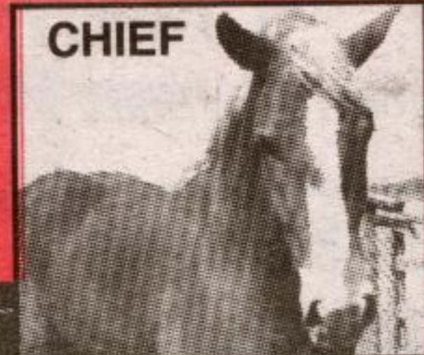
CHIEF BELGIAN DRAFT HORSE 17 HANDS