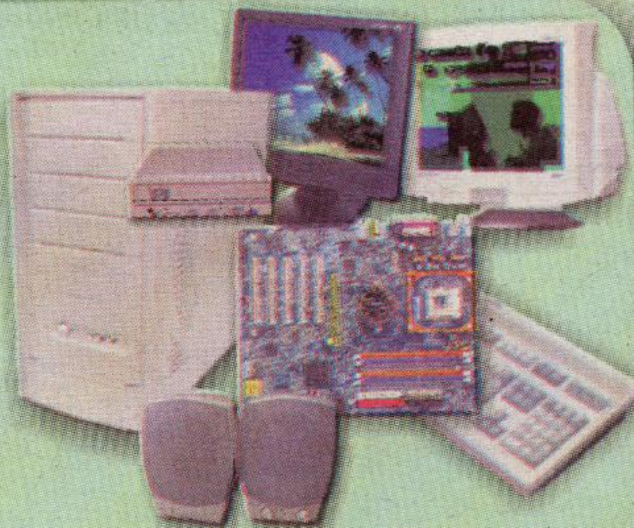
Products may not be exactly as shown

Power for Home or Office Use: Browse the internet, home banking, homework, burn Cd's, MSN chat, watch DVD movies, and much more.