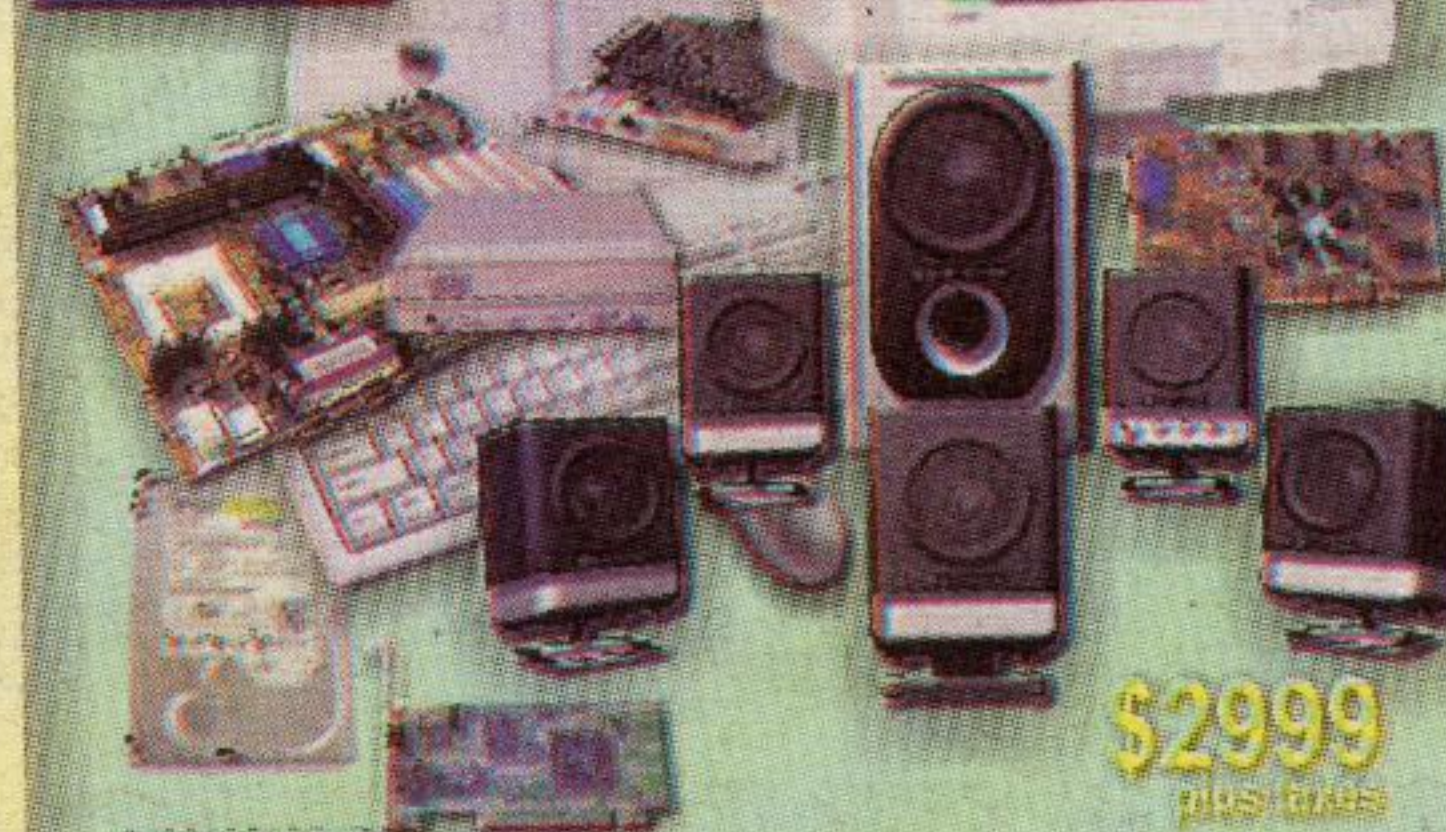
Products may not be exactly as shown