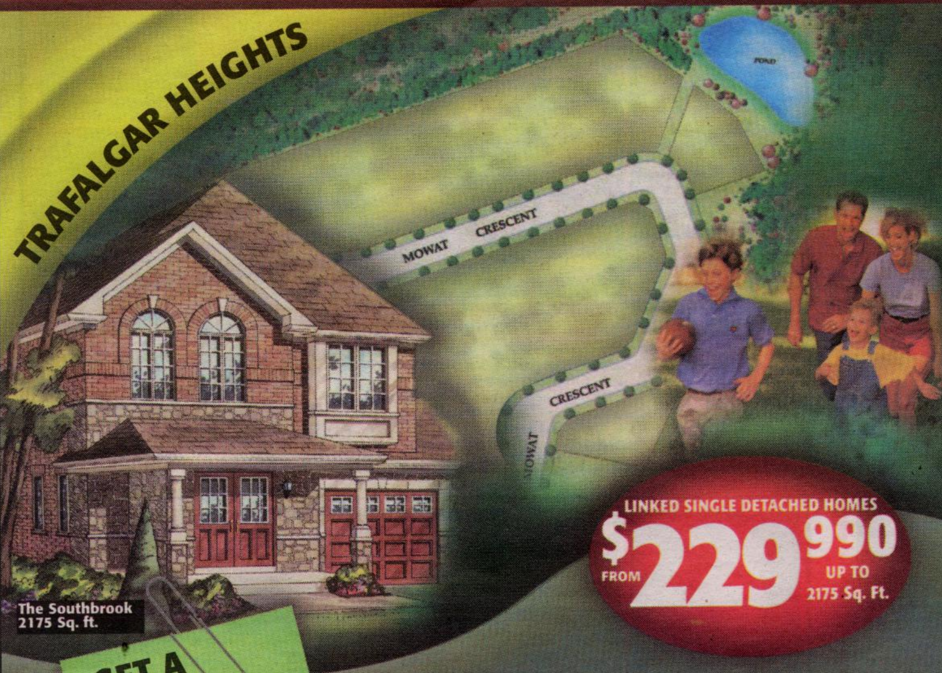
The Southbrook 2175 Sq. ft.

LINKED SINGLE DETACHED HOMES $229,990 FROM UP TO 2175 Sq. Ft.