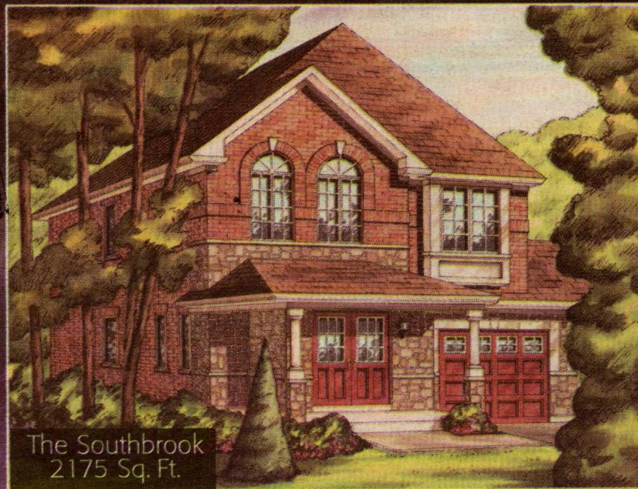
The Southbrook 2175 Sq. Ft.

On a child-safe crescent nestled between conservation lands and the established community of Trafalgar Country you'll find the best new home value for miles. A short five minute walk to downtown and easily accessible from Trafalgar Road make this location the perfect setting for your new home. Don't miss this buying experience.