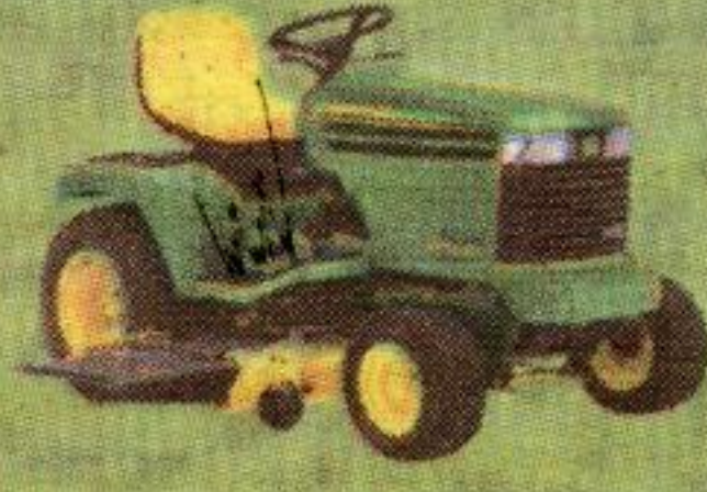
GX SERIES premium power, versatility, durability