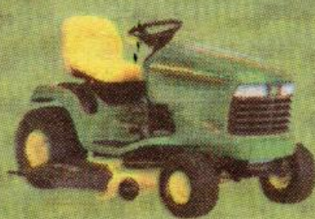
LT SERIES deluxe comfort, durability