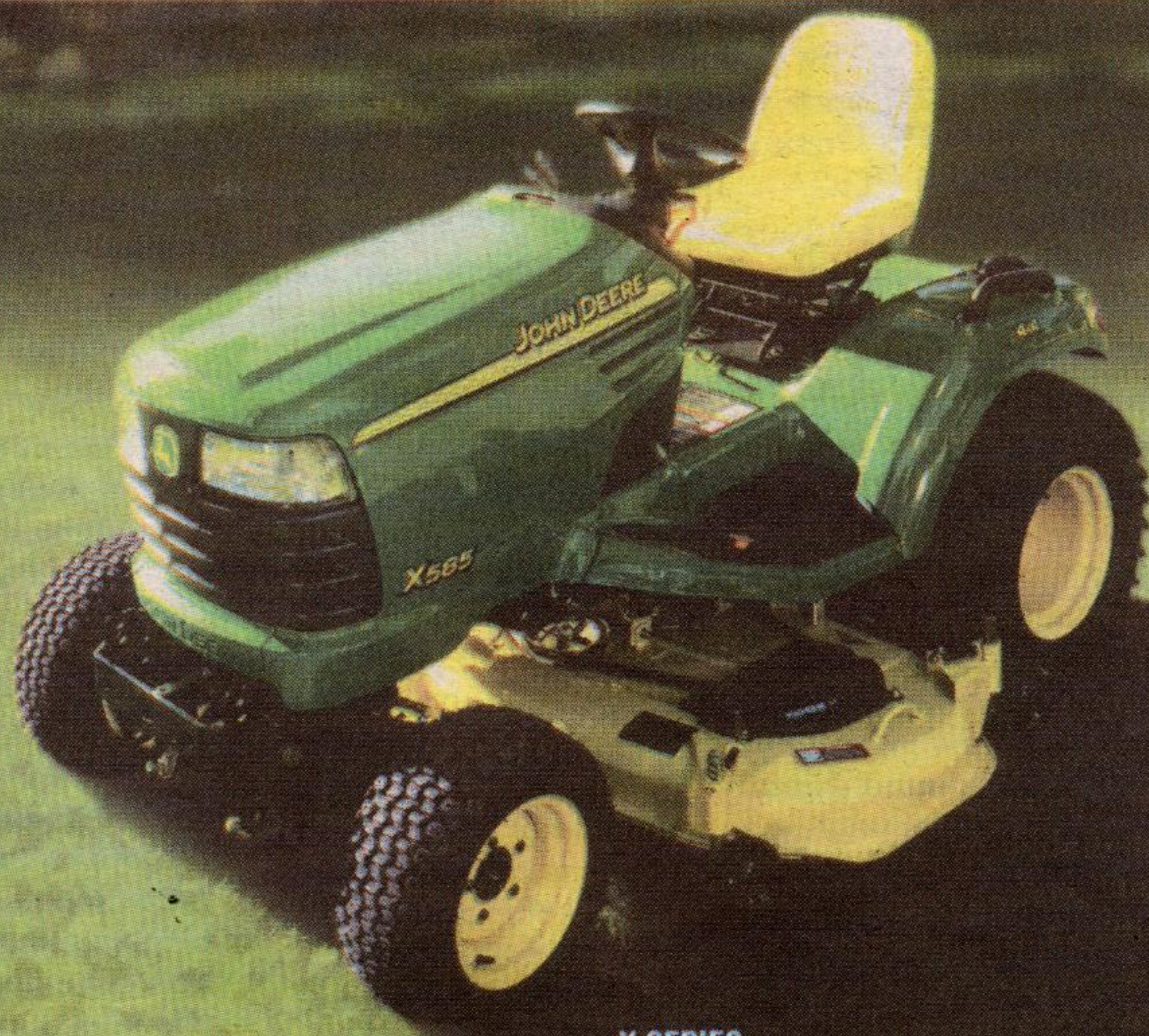
X SERIES ultimate power, versatility, performance