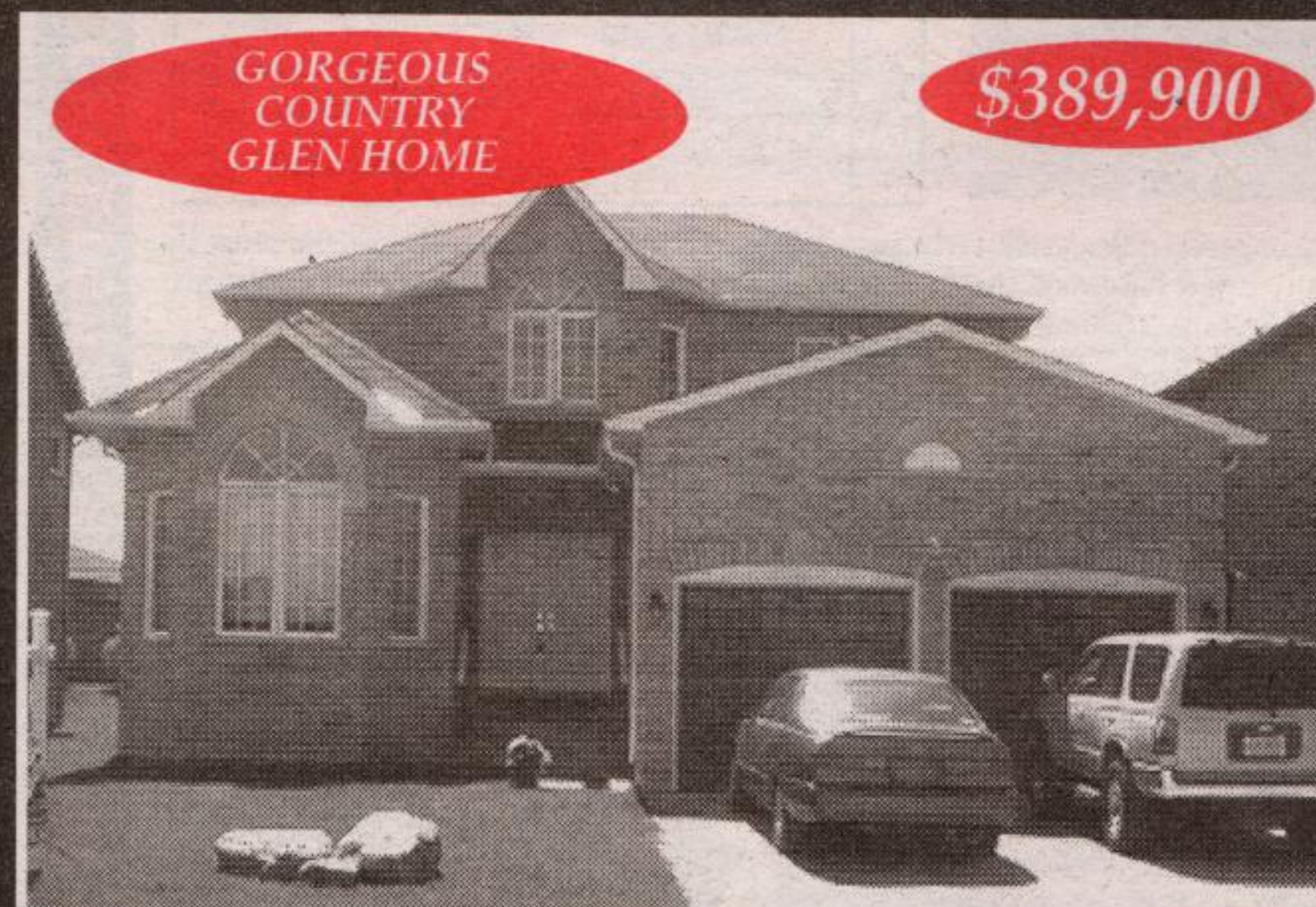
GORGEOUS COUNTRY GLEN HOME