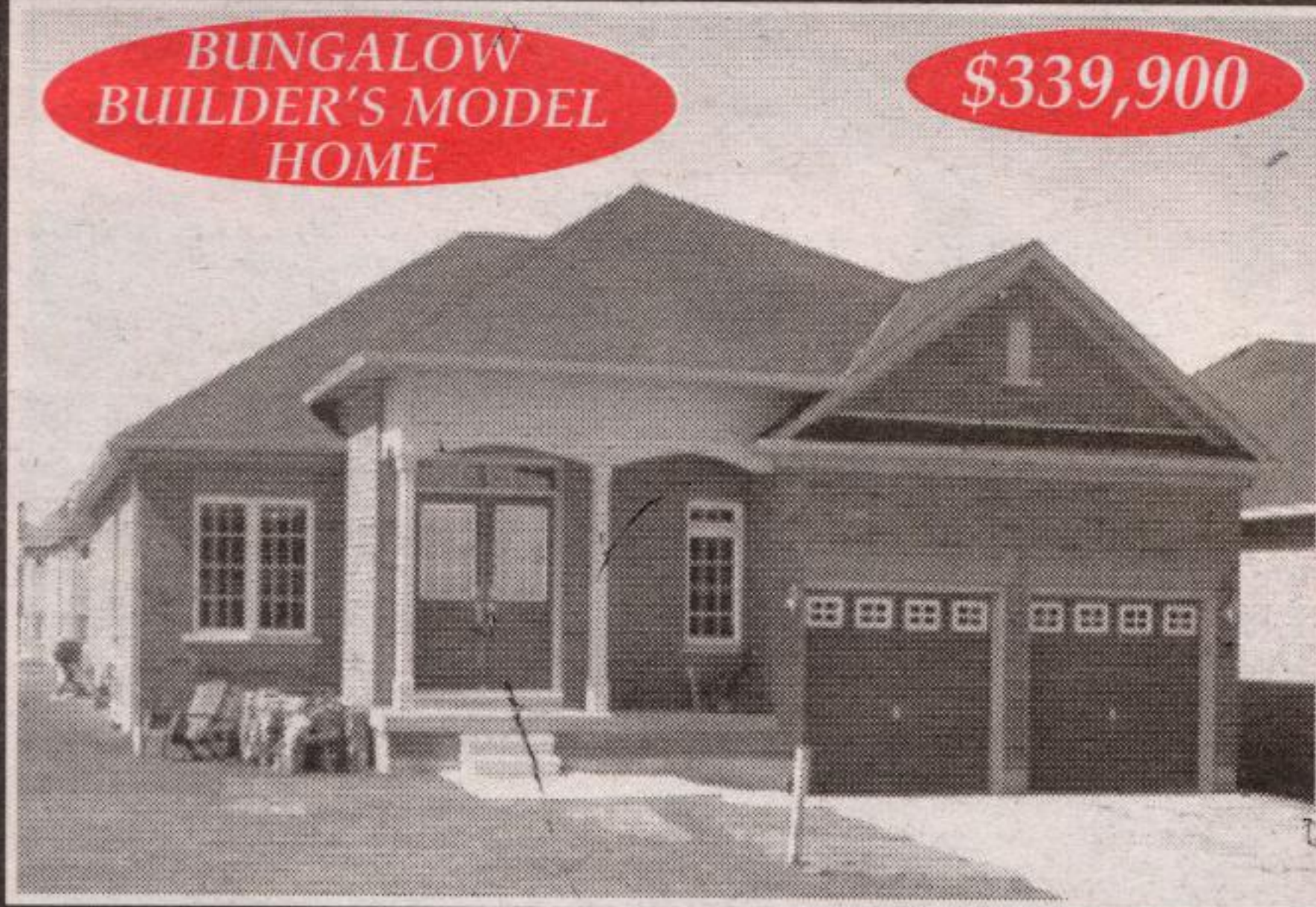
BUNGALOW BUILDER'S MODEL HOME

Georgetown Line 905 873-9255 Toronto Line 905 456-3232