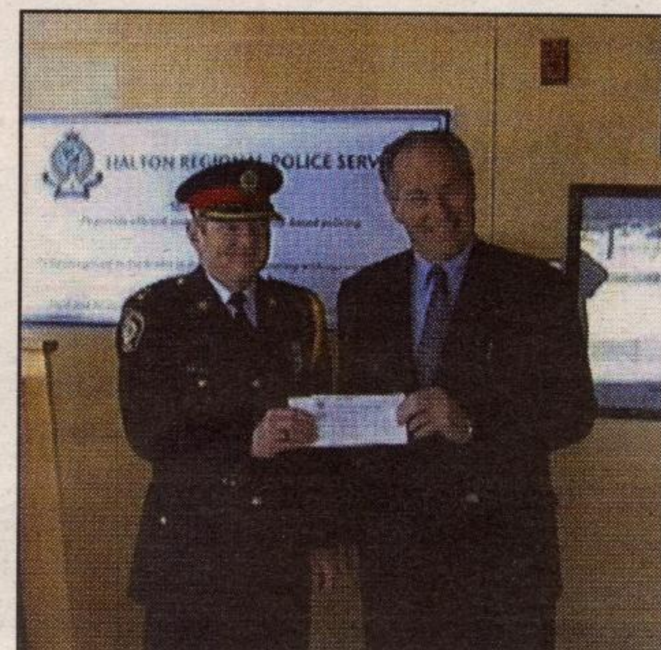
You already see 43 more Halton police on our streets thanks to a provincial program and we propose to double the size of the current program.