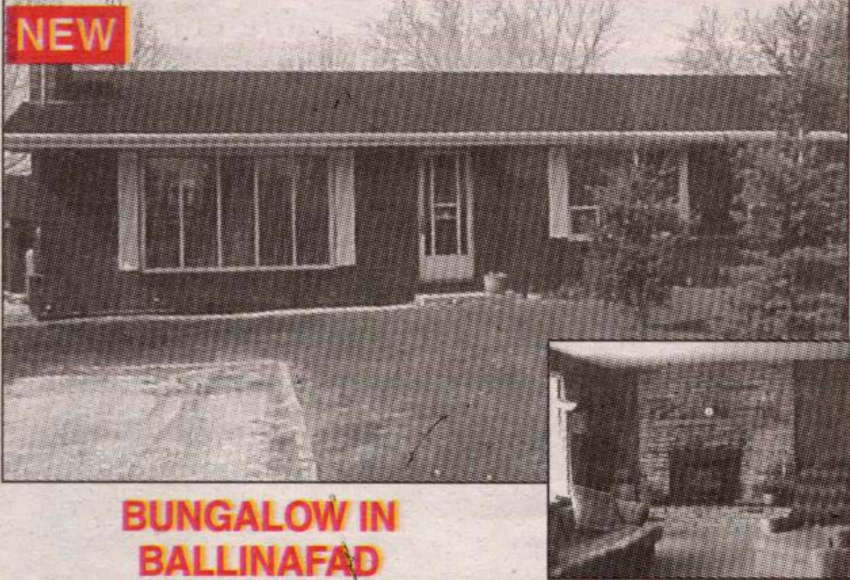
BUNGALOW IN BALLINAFAD

Great country value. This spacious brick bungalow is located on a landscaped & treed 1/2 acre lot. It is located close to the Ballinafad Community Park. Features of this home include gas fireplace in living room, main floor laundry, 3 piece ensuite, large deck overlooking backyard. C/A, finished basement & workshop area. Priced at $269,900. Call Dave Krause* to view.