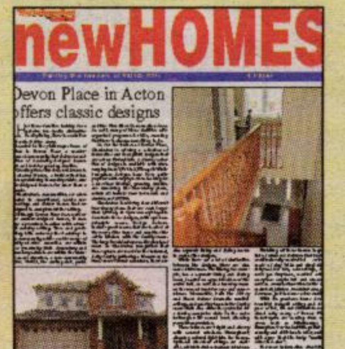
4-pg. New Homes inside Real Estate