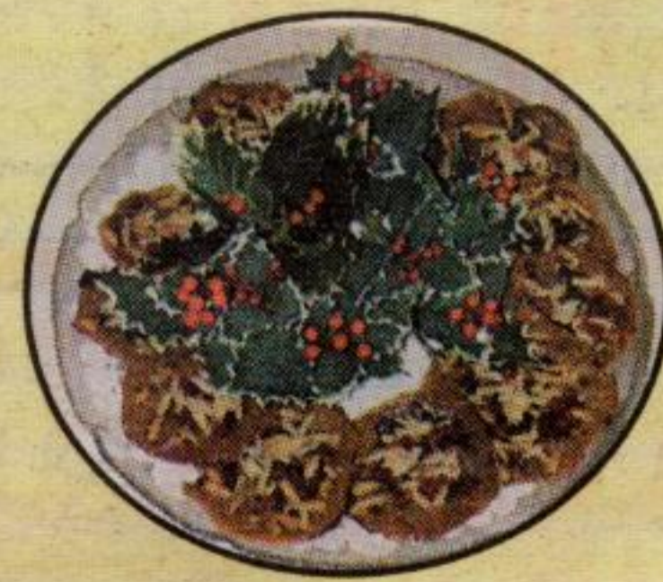
What's Cookin' page 20