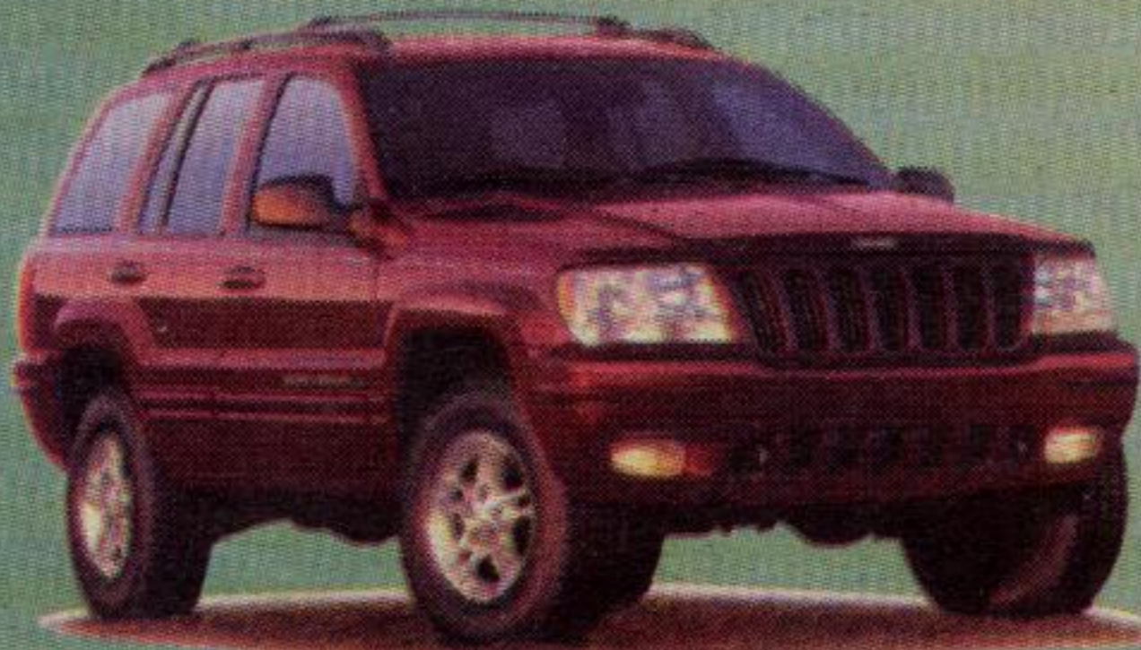
Jeep Grand Cherokee