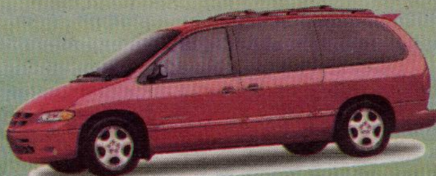
Dodge Caravan & Grand Caravan