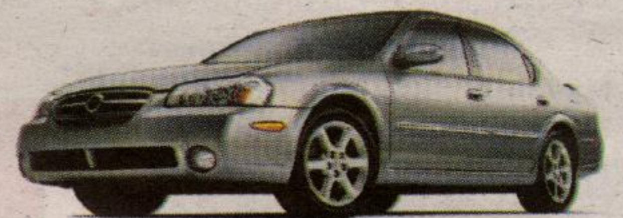
"The only engine to be an eight-time winner" - Ward's Auto World, Jan. 2002