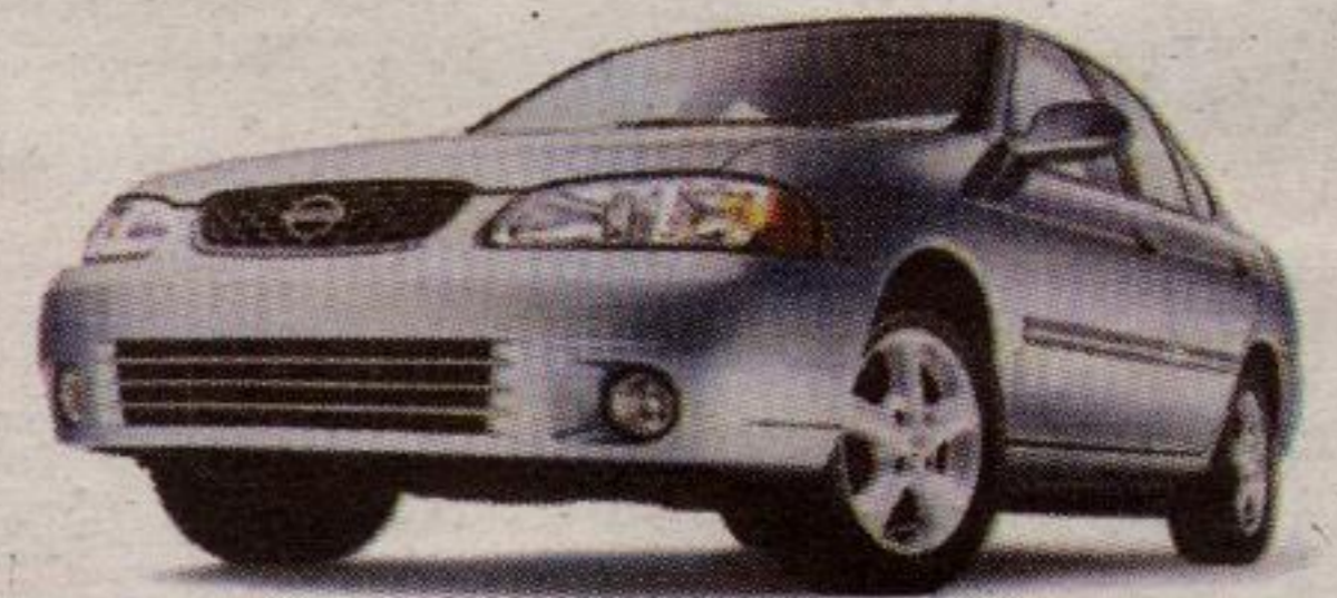
2003 Carguide/The Globe and Mail "Best Buy" Award Winner - Compact Car†

1.8% Financing.† OR Lease Sentra XE with Value Option Package for a low monthly payment of (for 48 months, only $1,980 down). $199 Includes Destination & Delivery.