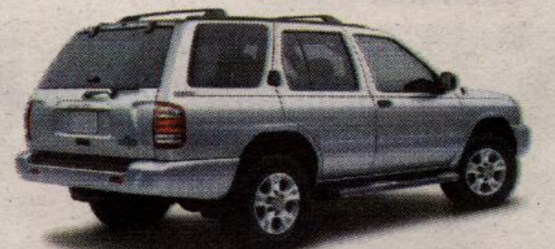
Nissan Pathfinder "Chilkoot Edition" only available in Canada