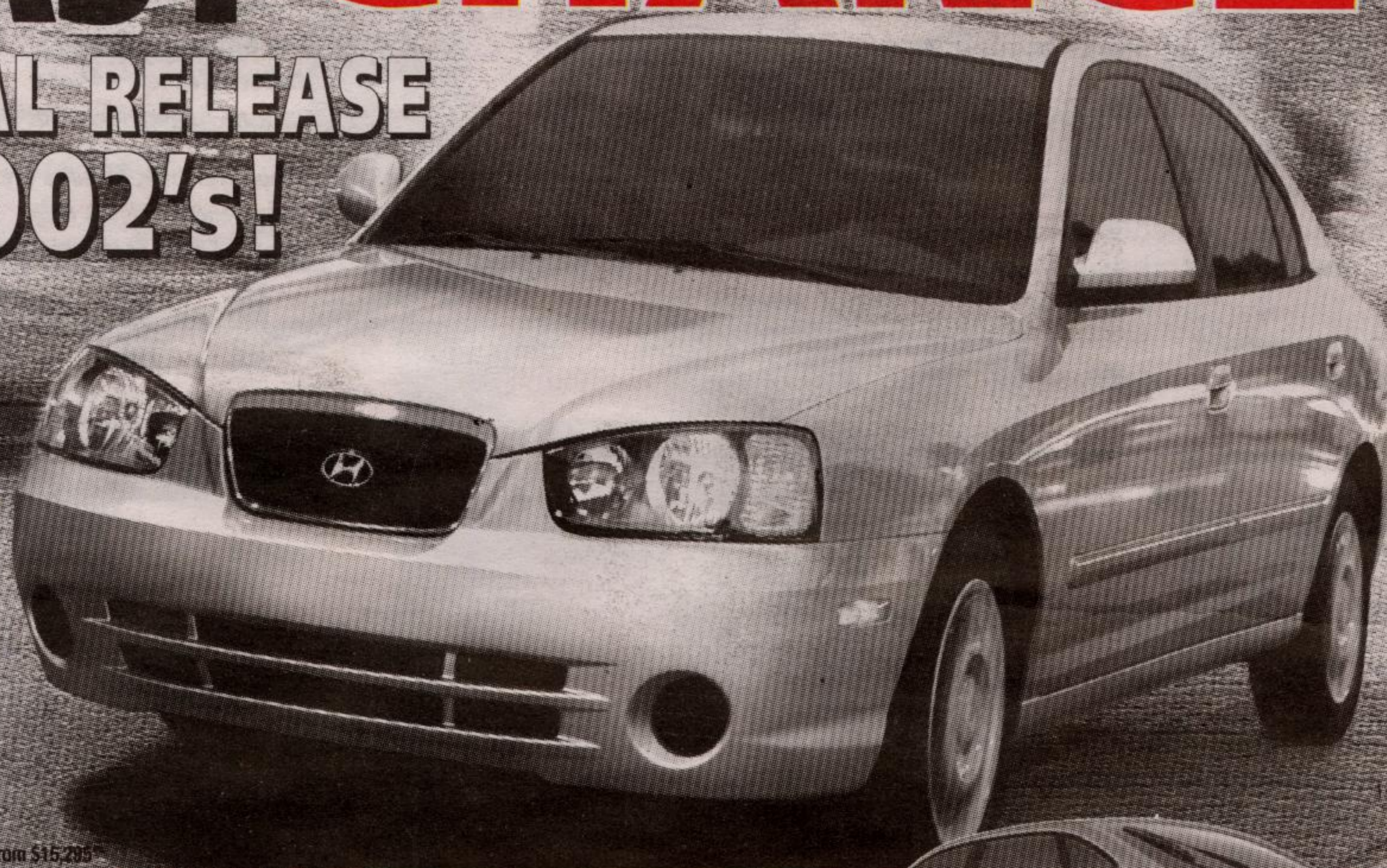
2002 Elantra GL MSRP From $15,205