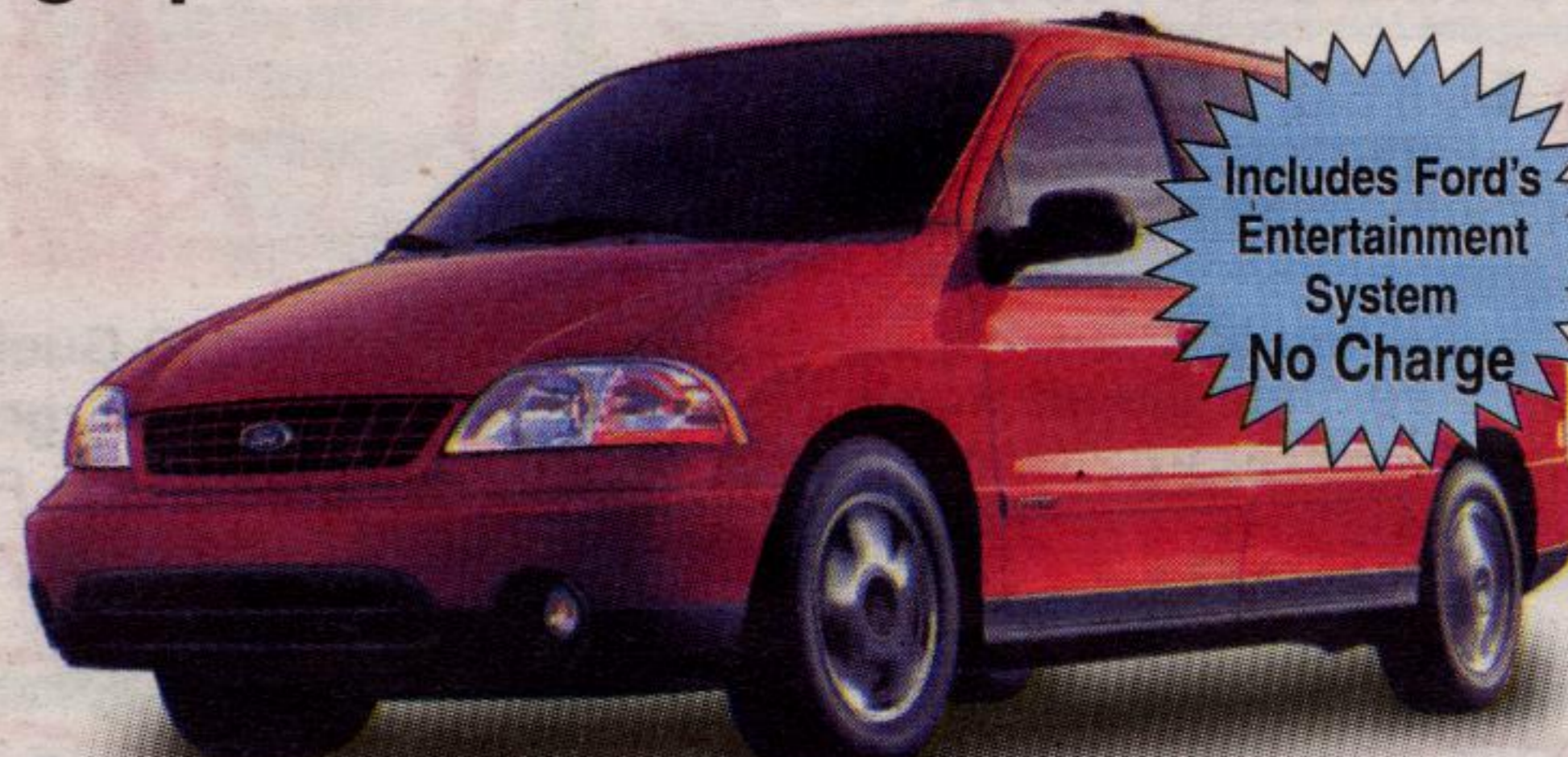
2003 WINDSTAR SPORT