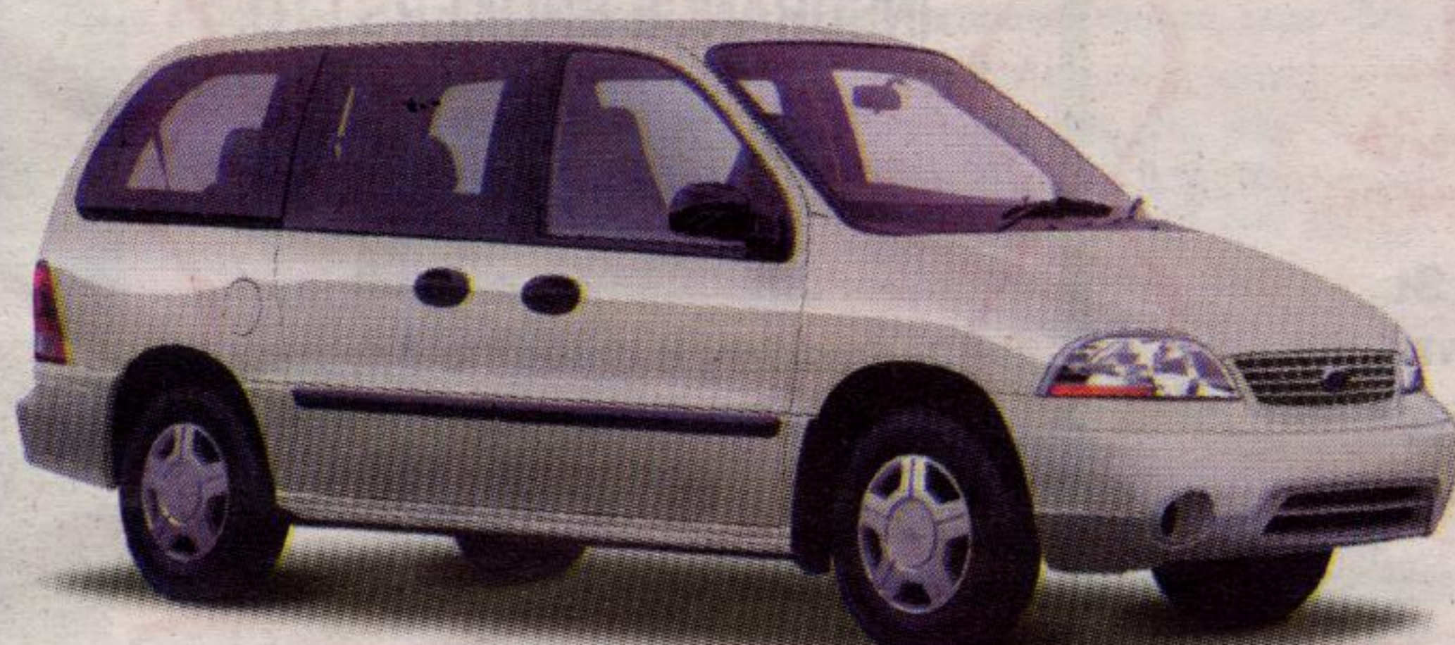
2003 WINDSTAR LX

Rebates as high as $3500.* 0% financing up to 60 months on 2002 models.