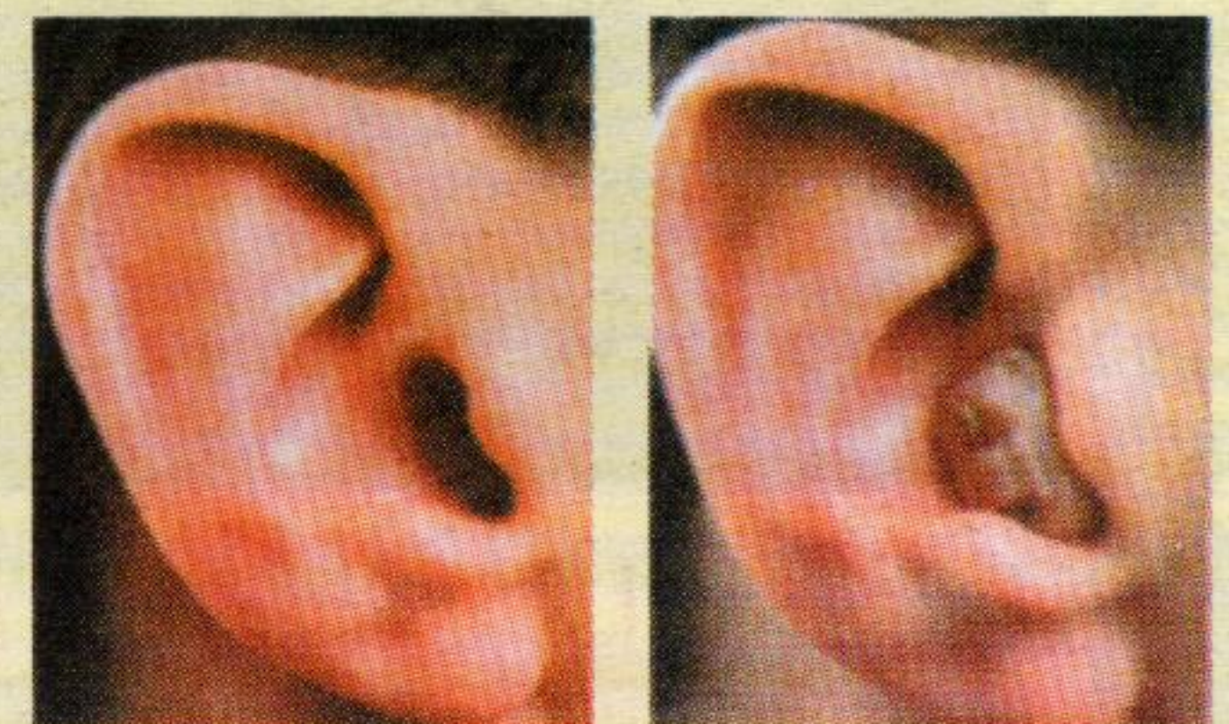
Cosmetically appealing Completely-in-the-Canal and In-the-Canal models

Hearing instruments can improve a lot more than just your hearing. If you suspect you or someone you know may have a hearing problem, call for an appointment.