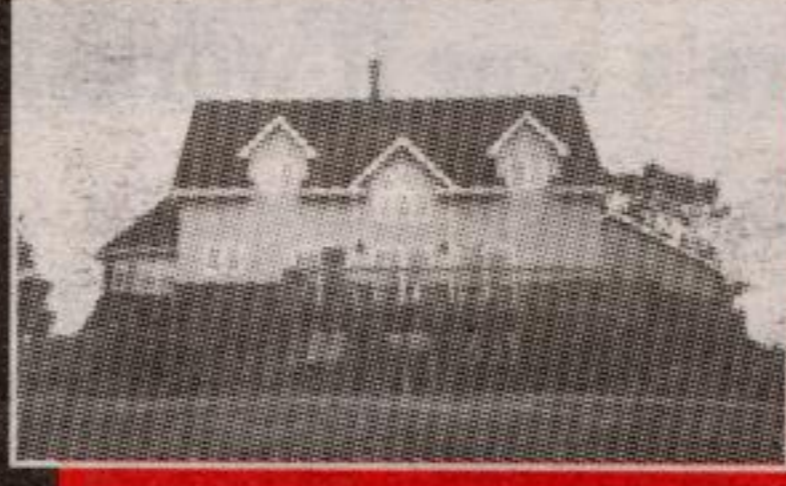
CAPE COD - 3 LEVELS WITH WALKOUT BASEMENT ON HILLSIDE. MANICURED 2 ACRE LOT

Immaculate brick/aluminum home, triple car garage, large master bedroom with ensuite. Beautiful main bath. Large custom designed kitchen, great room. Floor to ceiling brick fireplace. Hardwood and ceramic floors. Octagon sunroom. Long paved, treed driveway. Perennial and rock gardens. Large wrap-around deck. Finished basement with walkout. Call Wayne Baguley* (519) 941-5151 or (905) 450-3355.