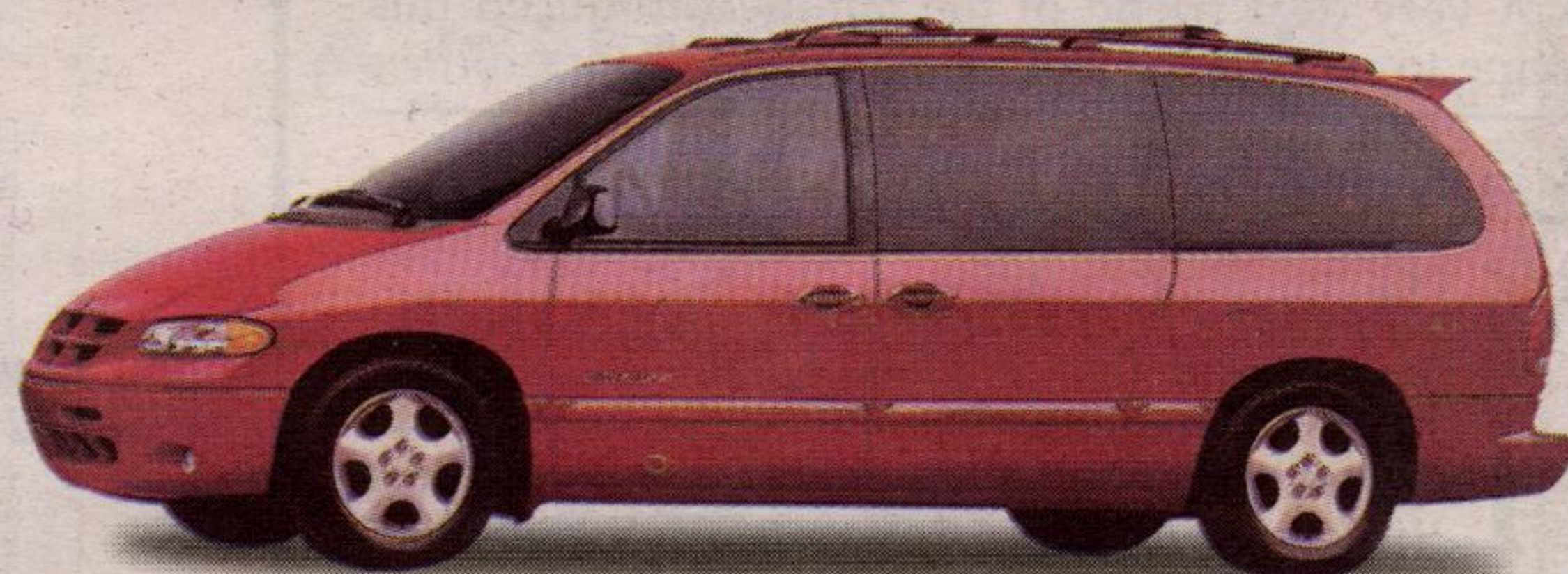
Dodge Caravan & Grand Caravan

7 YEARS OF 115,000 KM ENGINE AND TRANSMISSION WARRANTY. PLUS 24 HOUR ROADSIDE ASSISTANCE.‡