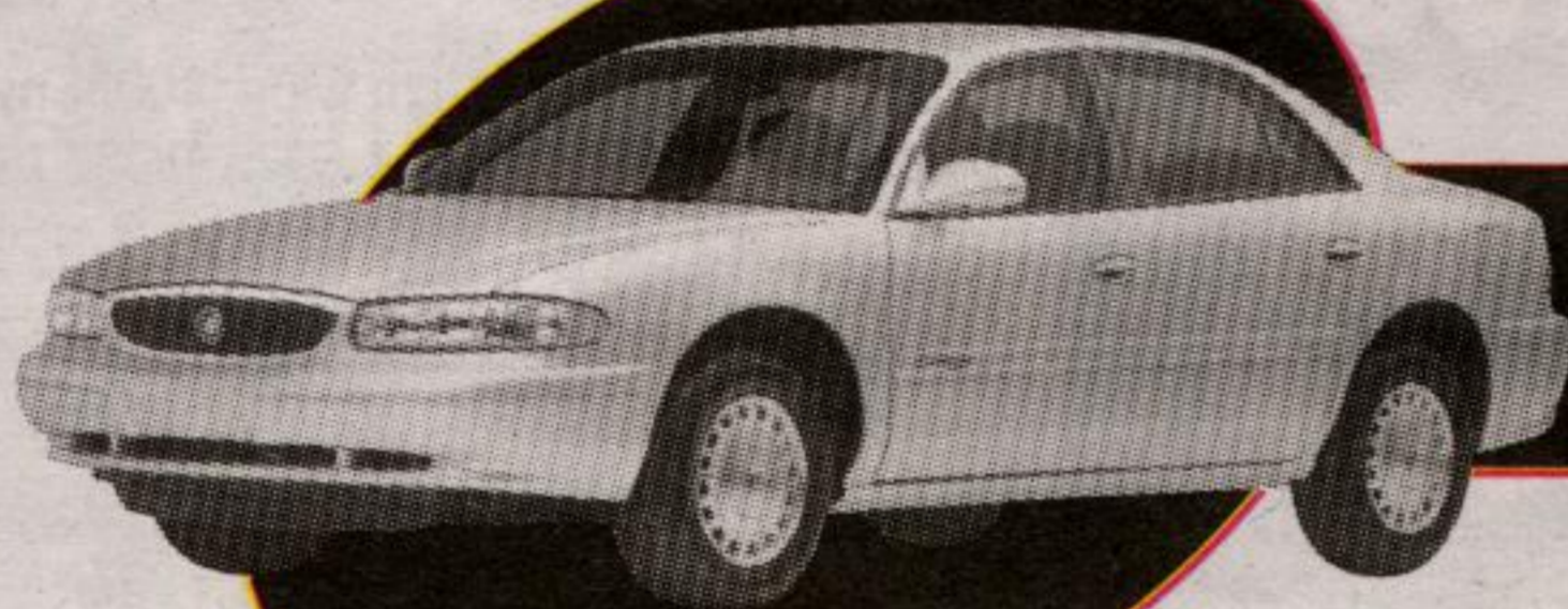
2002 Buick Century Special Edition