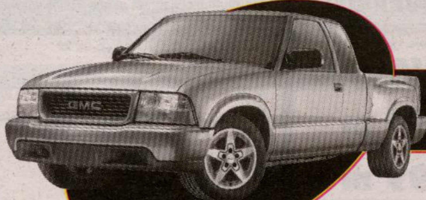
2002 GMC Sonoma