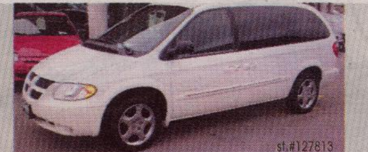
2001 Dodge Grand Caravan "ES" Every conceivable option, including some never thought of. "Exceptional" $23,995

30 Passenger Vans Caravans, Voyagers, Windstars, Safaris, Astros, Silhouettes, Mazdas, Toyotas, Nissans & more.