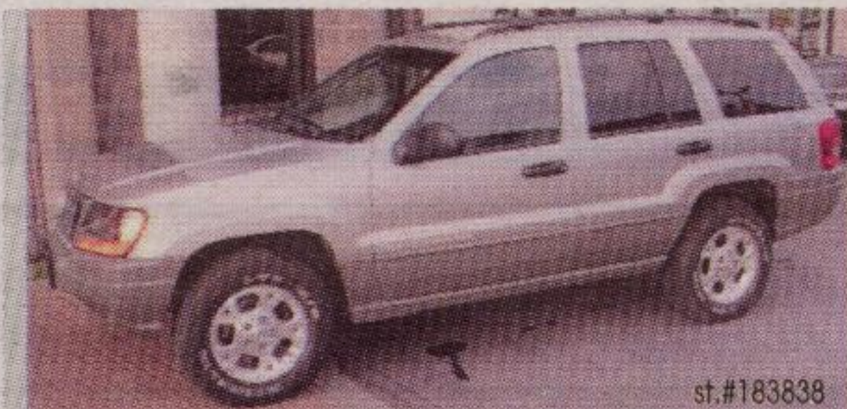
2000 Jeep Grand Cherokee Laredo 6 cyl, with most options inc. sunroof $21,995

33 Sport Utilities Jeeps, Jimmy's, Blazers, Yukons, Explorers, 4dr & 2dr