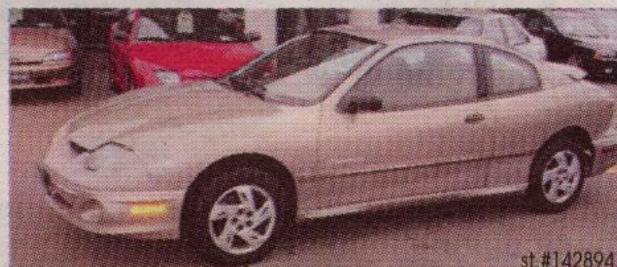
2000 Pontiac Sunfire 2dr, auto, air $10,995

59 Compact Economical Vehicles Cavaliers, Sunfires, Neons, Escorts, Saturns, etc. Priced from $4,995 to $17,995