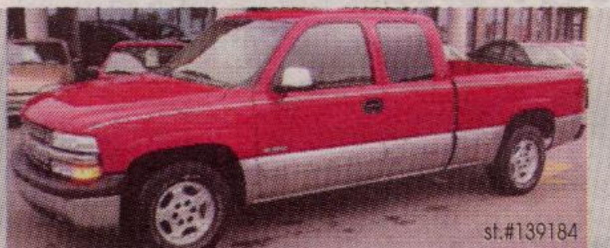
2000 Chev Silverado "LS" Extended cab, low, low mileage, 35,228 km. BALANCE OF MFG'S WARRANTY $27,995

22 Trucks. 4x4 Suburbans, Yukons, GMC & Chev Ext'd cabs, Fords, Dodges, Nissans & more. Priced from $7,675 to $29,995