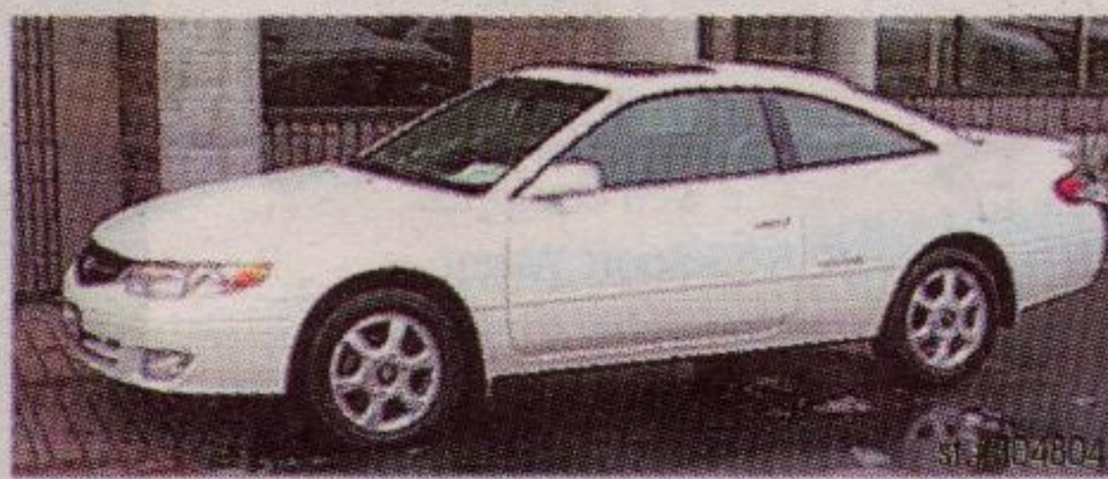
2000 Toyota Solara SLE Pearl white, with all options incl' sunroof $21,995

48 Pre-Owned Toyotas Cars, Vans, Sport Utilities - 4 Runners, Camrys, Corollas, Sienna Vans, Avalons & Solara Prices from $5,995 to $29,995