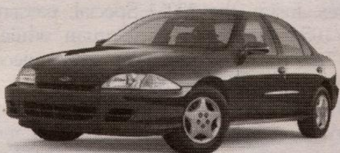
2002 CHEVROLET CAVALIER VL COUPE OR SEDAN 5-Year/100,000 km Powertrain Warranty

**CERTAIN TAXES, PPSA AND ADMINISTRATION FEES MAY APPLY