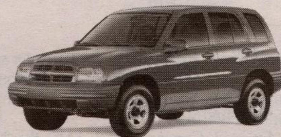
2002 CHEVY TRACKER LX 4x4