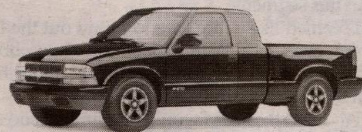
2002 CHEVY S-10 EXTENDED CAB

FIVE STAR SAFETY RATING. Chevrolet Venture holds a 5-Star front seat rating in side-impact tests.†