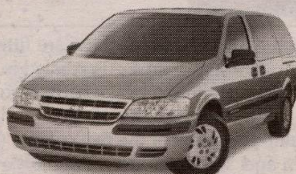
2002 CHEVROLET VENTURE VALUE VAN