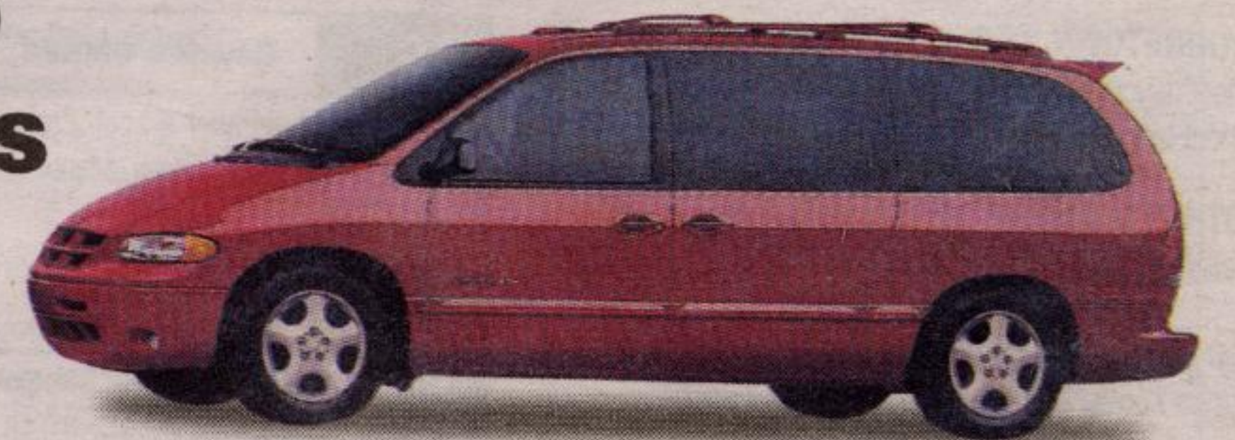
Dodge Caravan & Grand Caravan