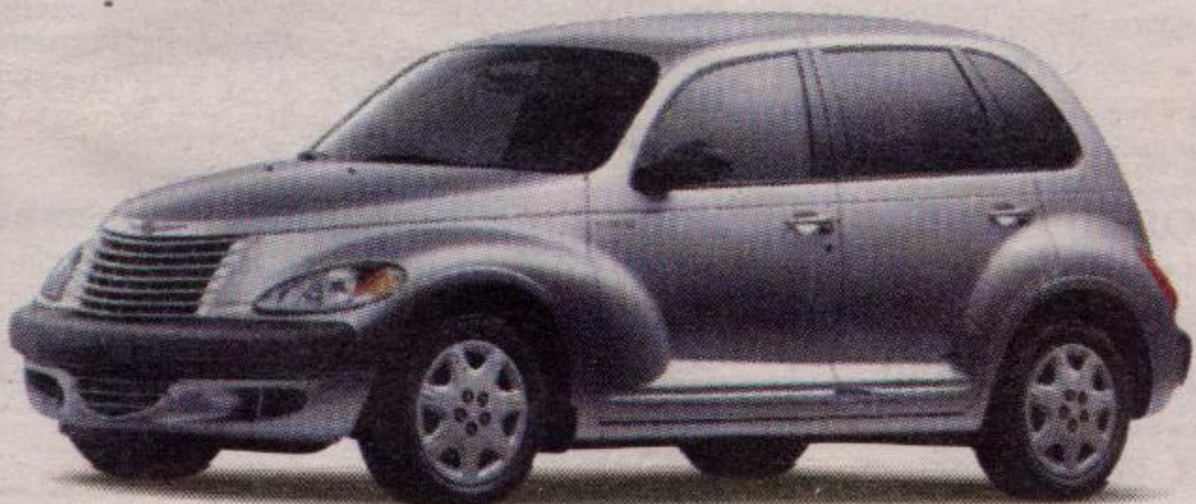
Chrysler PT Cruiser

or up to $3,000 Cash Savings† on selected models