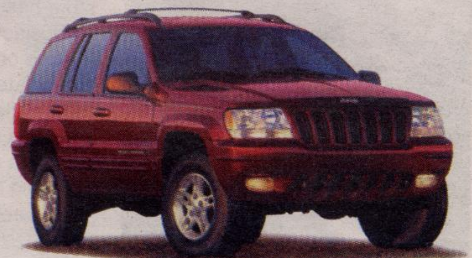
Jeep Grand Cherokee