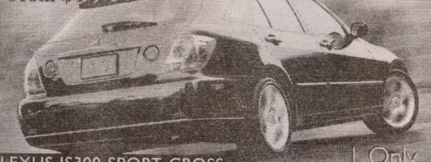
LEXUS IS300 SPORT CROSS