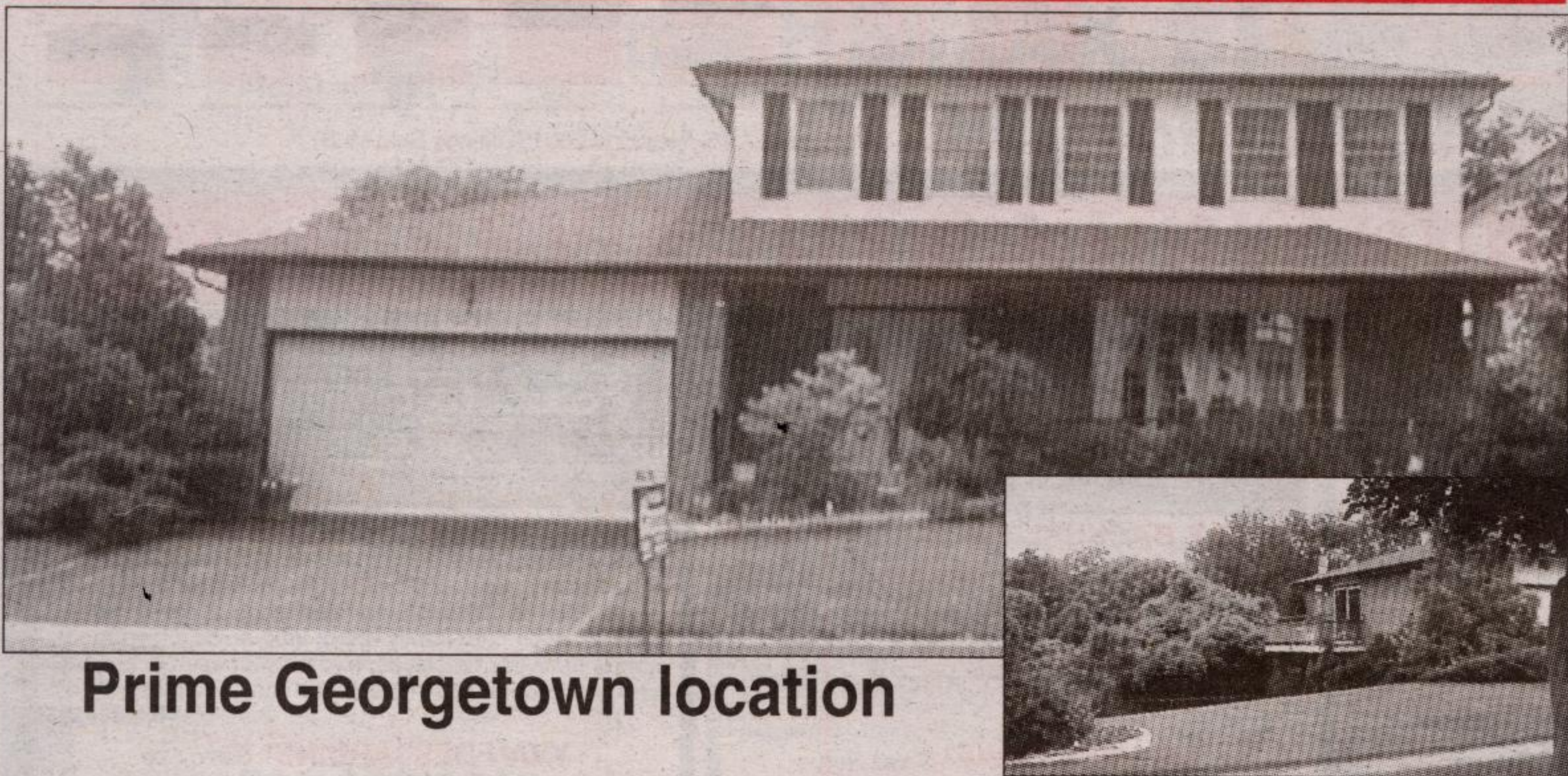
Prime Georgetown location

Large principal rooms. Beautiful new bay window and double front doors. New furnace, new shingles, walkout from family room to balcony, full basement with walkout.