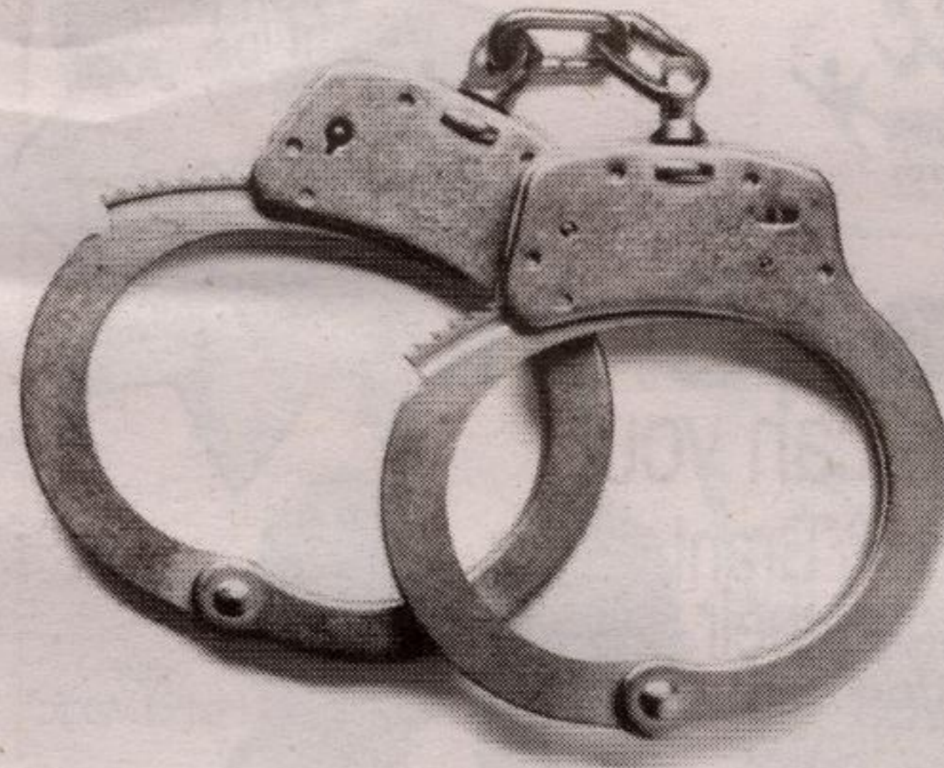
What you usually get when you drive away without paying.