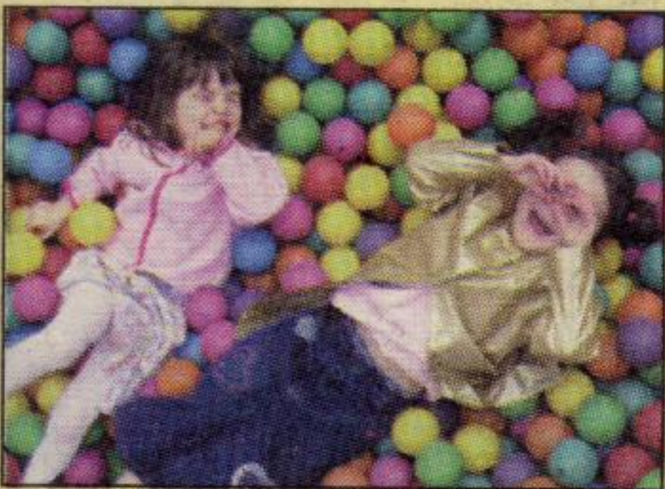
A Bang-o-Rama holiday ...page 8