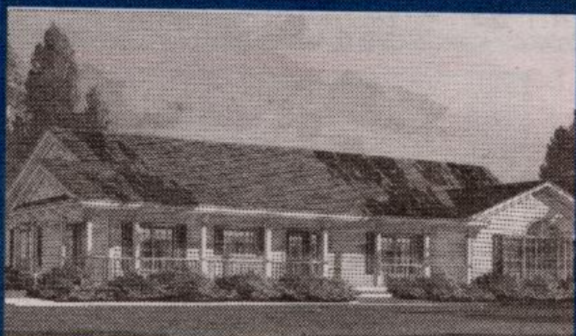
The Carleton - From the $150,000's

When you buy a Quality Home on your lot you will receive 6% of the purchase price to spend at Sears on whatever you want, whenever you want!