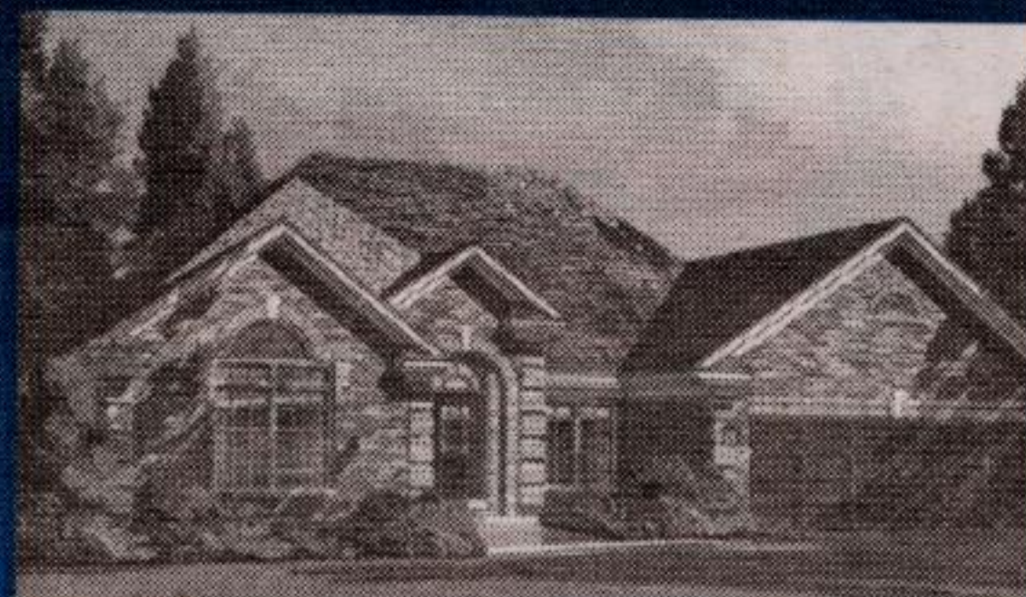
The Saugeen - From the $160,000's

See these decorated models for yourself!