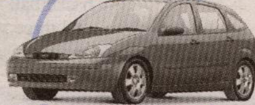
Ford Focus is the best selling car in the world.†††