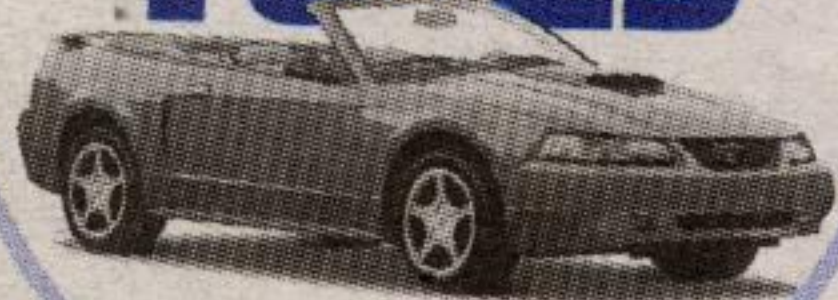
2002 Ford Mustang GT Convertible 2-Year Leases