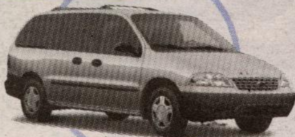
Windstar earned the highest U.S. Government Crash Test Rating for front and side impact - Quadruple Five Star Safety Rating.†