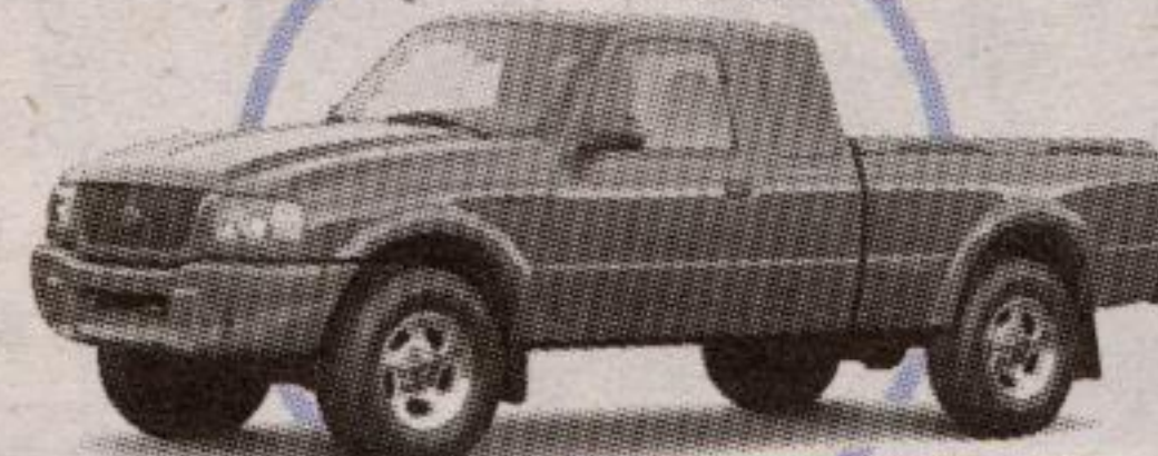
2002 Ford Ranger