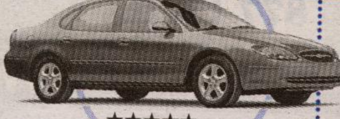
Taurus earned the highest U.S. Government Crash Test Rating for front impact - Double Five Star Safety Rating.††