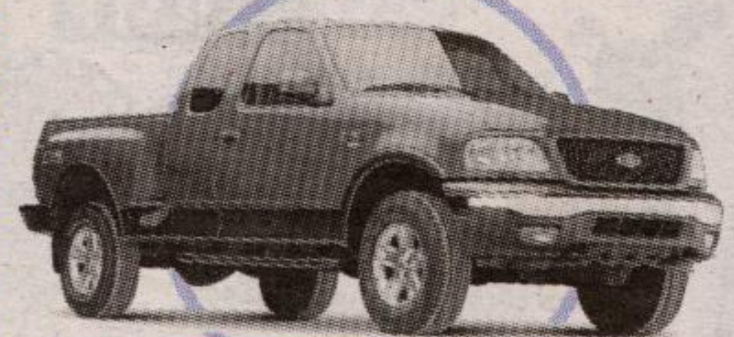
2002 Ford F-Series