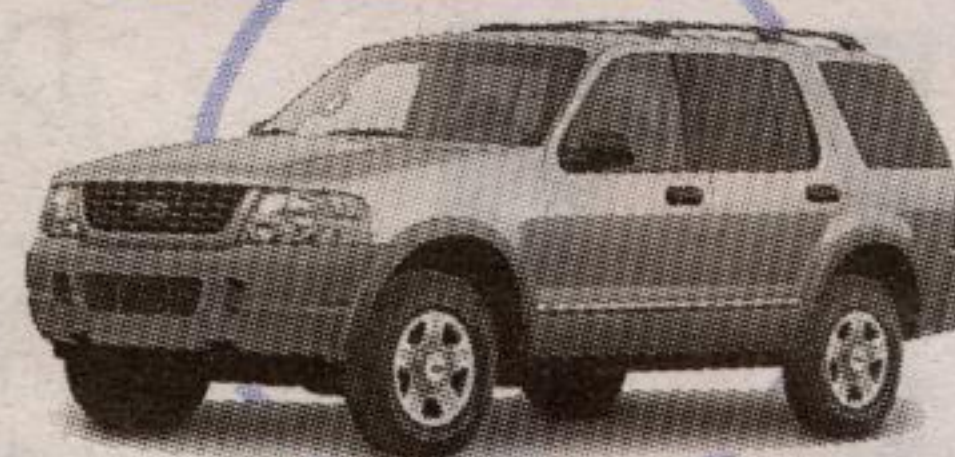
Insurance Institute for Highway Safety's 'Best Pick'.††