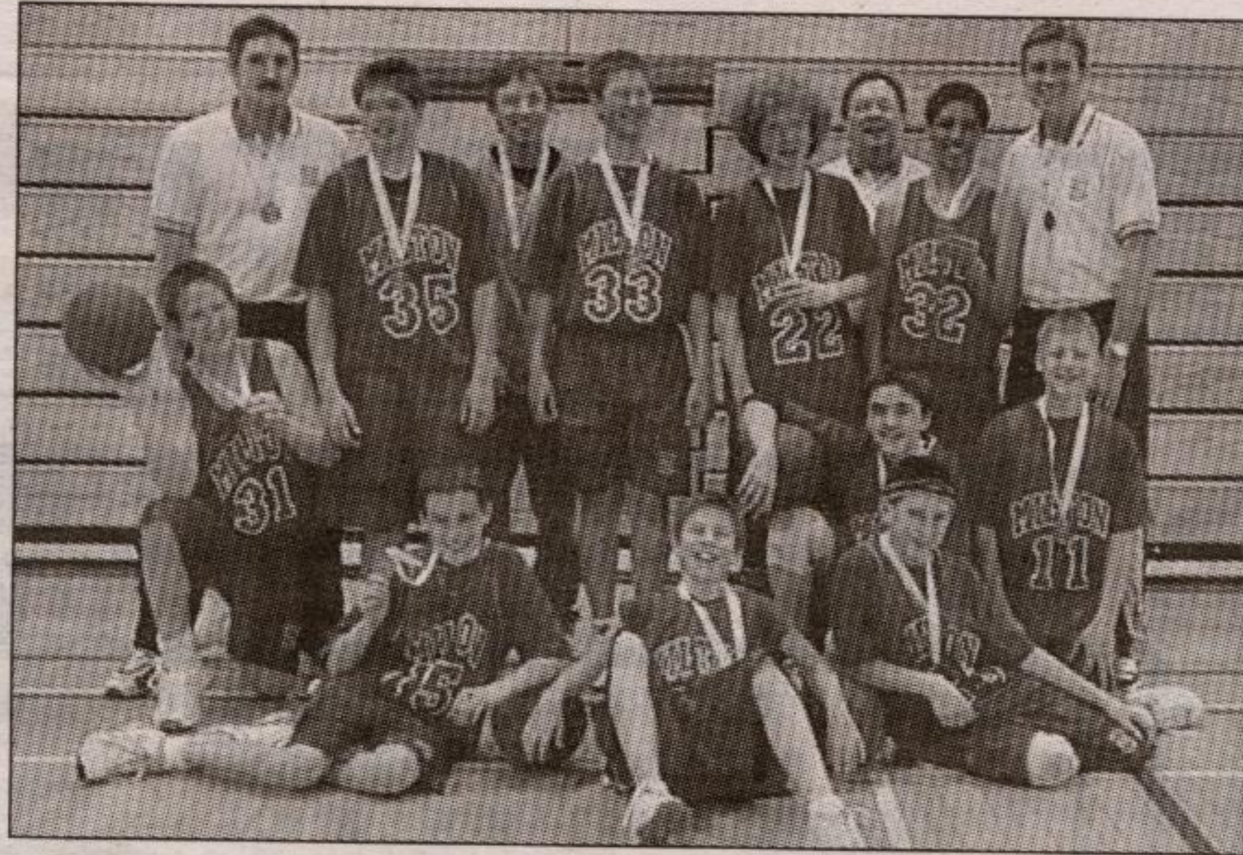
MILTON MADD DAWGS