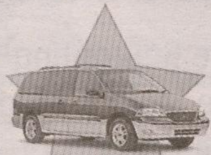
2002 FORD WINDSTAR

Windstar earned the highest U.S. Government Crash Test Rating for front and side impact - Quadruple Five Star Safety Rating.*