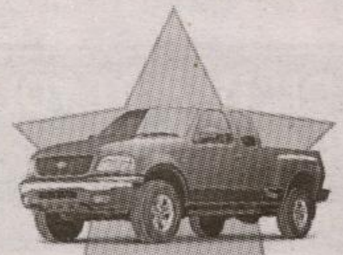
2002 FORD F-150

FORD RANGER IS THE BEST-SELLING COMPACT TRUCK IN THE WORLD**