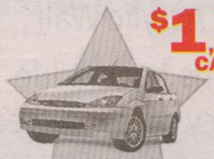
2002 FORD FOCUS

Taurus earned the highest U.S. Government Crash Test Rating for front impact - Double Five Star Safety Rating.**