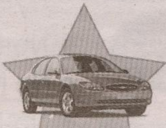
2002 FORD TAURUS

Windstar earned the highest U.S. Government Crash Test Rating for front and side impact - Quadruple Five Star Safety Rating.*