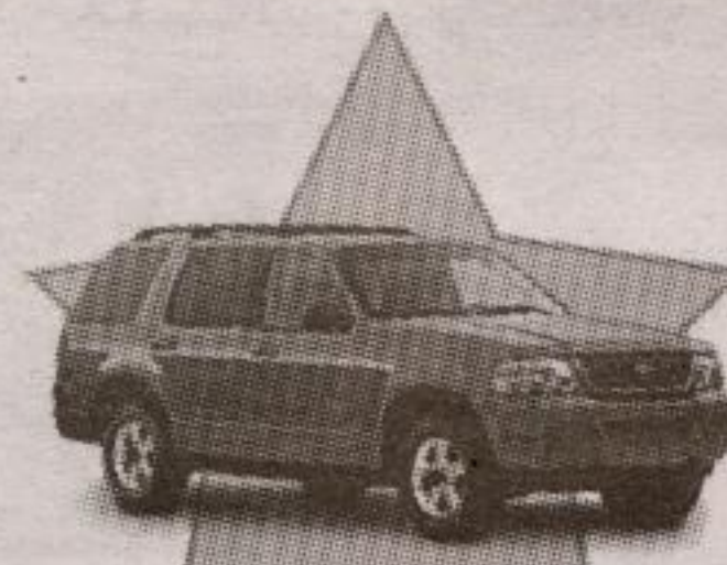
2002 FORD EXPLORER

FORD F-SERIES IS THE BEST-SELLING TRUCK IN THE WORLD*