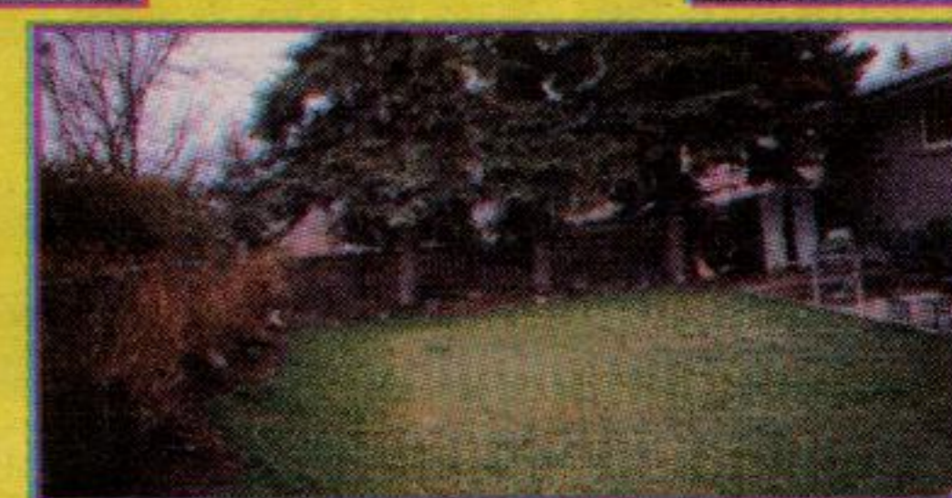
HUGE POOL SIZED LOT WITH MATURE TREES

4 level sidesplit in much desired Moore Park, adjacent to school and park. Glowing refinished hardwood floors throughout, updated kitchen with walkout. Main floor family room with walkout plus finished basement. 4 bedrooms, 2 bathrooms, Pergo floor in family room, large living and dining rooms. Great area for your children. $249,900.