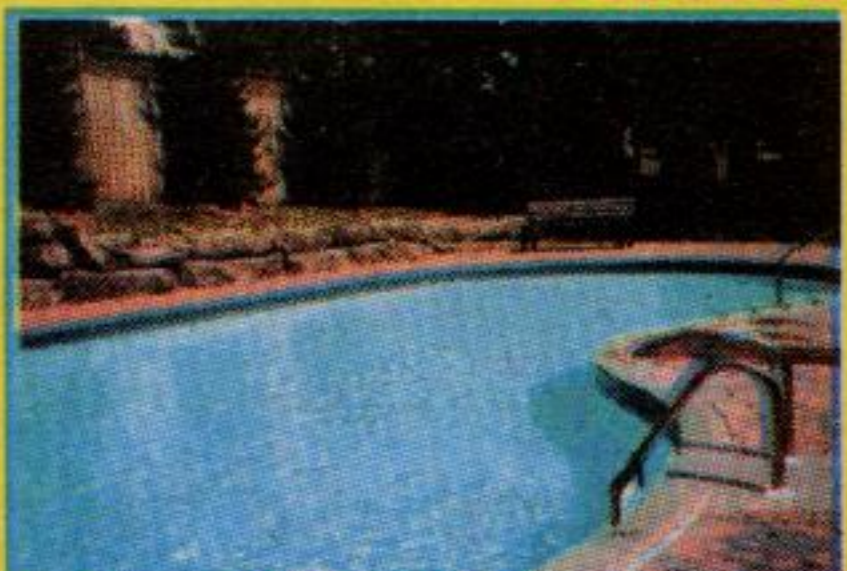
HEATED INGROUND POOL ON SITE

Don't Wait ... This totally upgraded luxury townmanor won't last. 3 bedroom, 3 baths, 10+++.