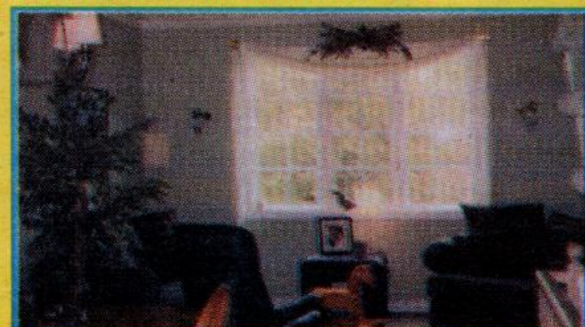
ELEGANT LIVING ROOM