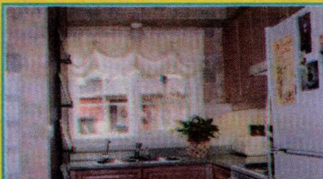
GORGEOUS UPGRADED KITCHEN

Don't Wait ... This totally upgraded luxury townmanor won't last. 3 bedroom, 3 baths, 10+++.