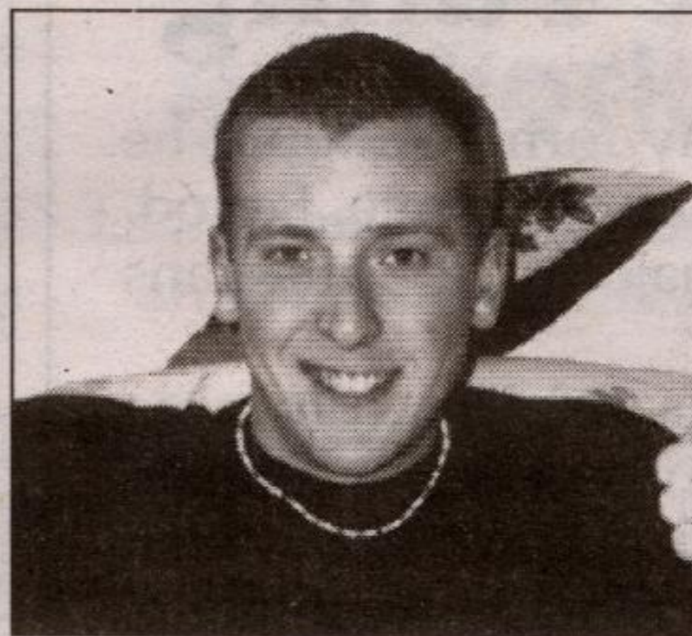
Love Mom, Dad, Baba, Gido & Grandpa