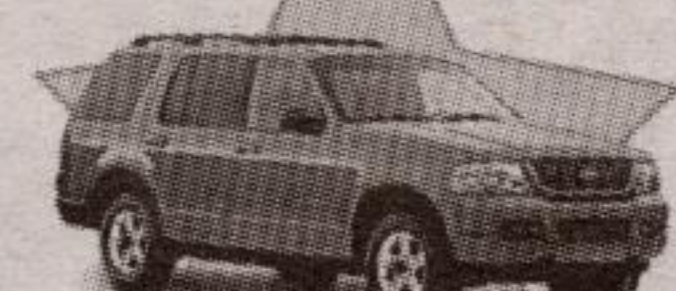
2002 FORD EXPLORER

FORD F-SERIES IS THE BEST SELLING TRUCK IN THE WORLD*