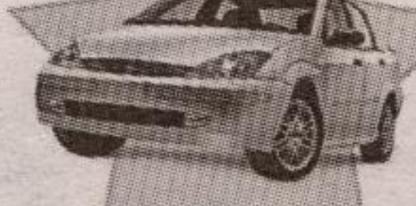
2002 FORD FOCUS

FORD FOCUS IS THE BEST SELLING CAR IN THE WORLD*