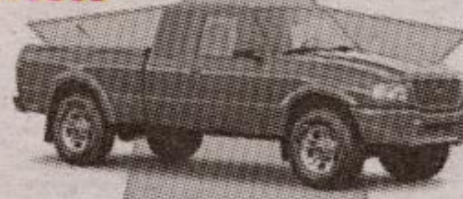
2002 FORD RANGER

FORD FOCUS IS THE BEST SELLING CAR IN THE WORLD*