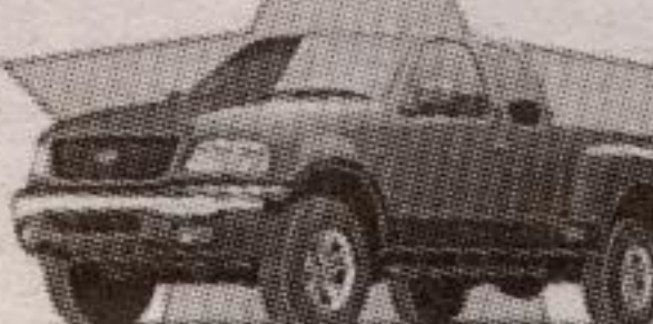
2002 FORD F-150

FORD RANGER IS THE BEST SELLING COMPACT TRUCK IN THE WORLD**