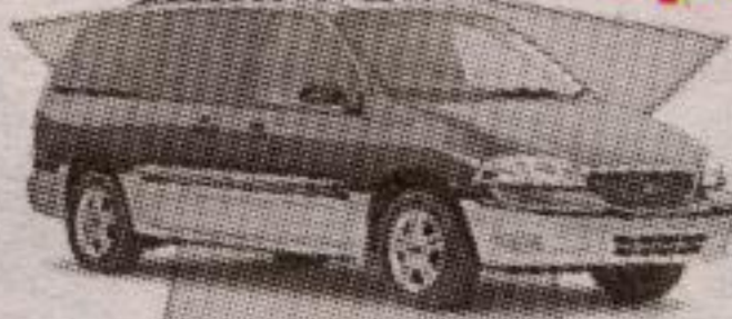
2002 FORD WINDSTAR