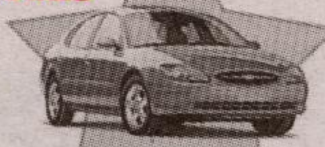
2002 FORD TAURUS

Windstar earned the highest U.S. Government Crash Test Rating for front and side impact - Quadruple Five Star Safety Rating.†